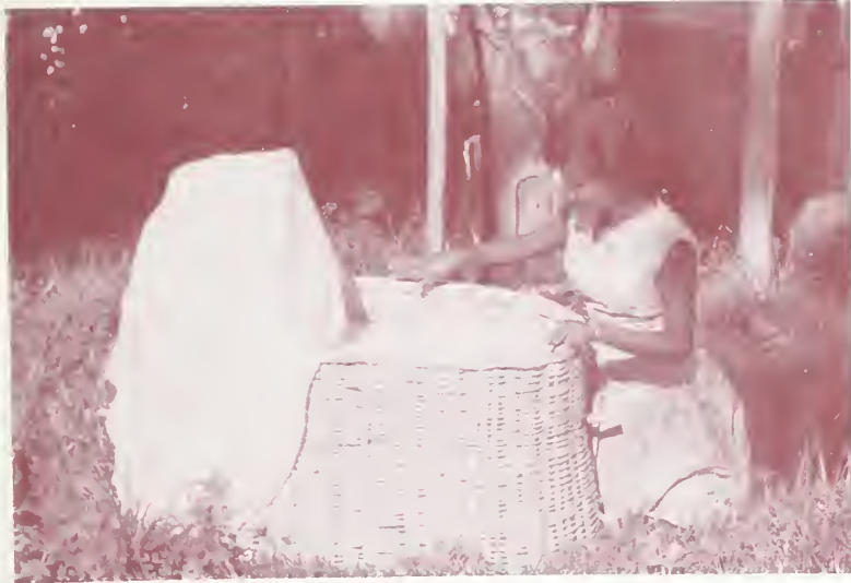
Young Ethiopian women learn to make babies' beds to keep their children clean and safe.