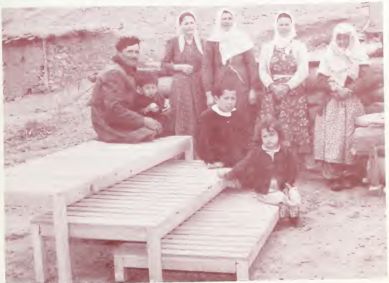
This Turkish man built these beds, which nest to store in a small place.