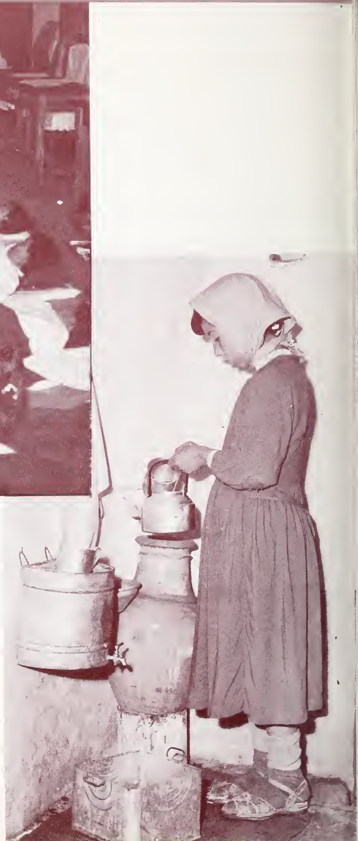
A family in Jordan stores their water in covered containers after it is purified.