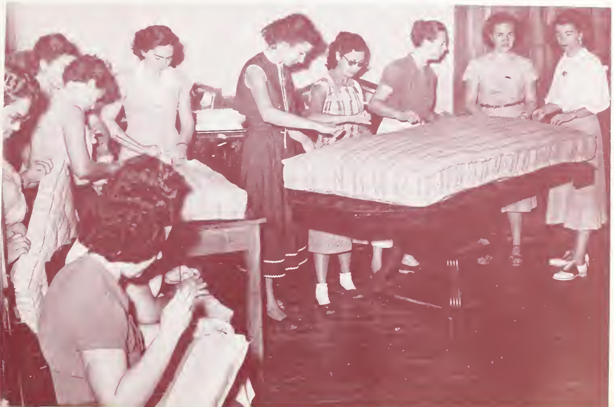
These Brazilian women have found that a good homemade mattress of cornhusks is comfortable and also saves money for other needs.