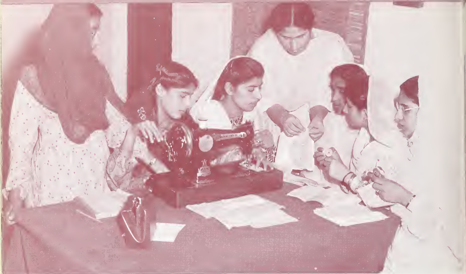
Pakistani village workers learn basic sewing skills...

and in the villages put them to practical use helping women learn by doing.