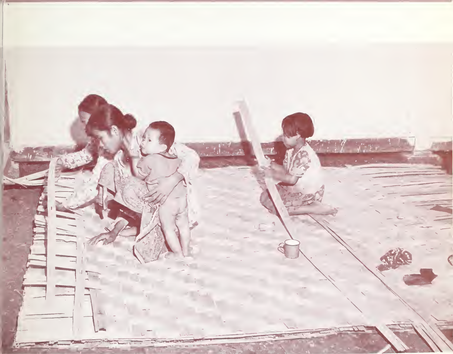
Village family in Indonesia weaving bamboo mats for sale.