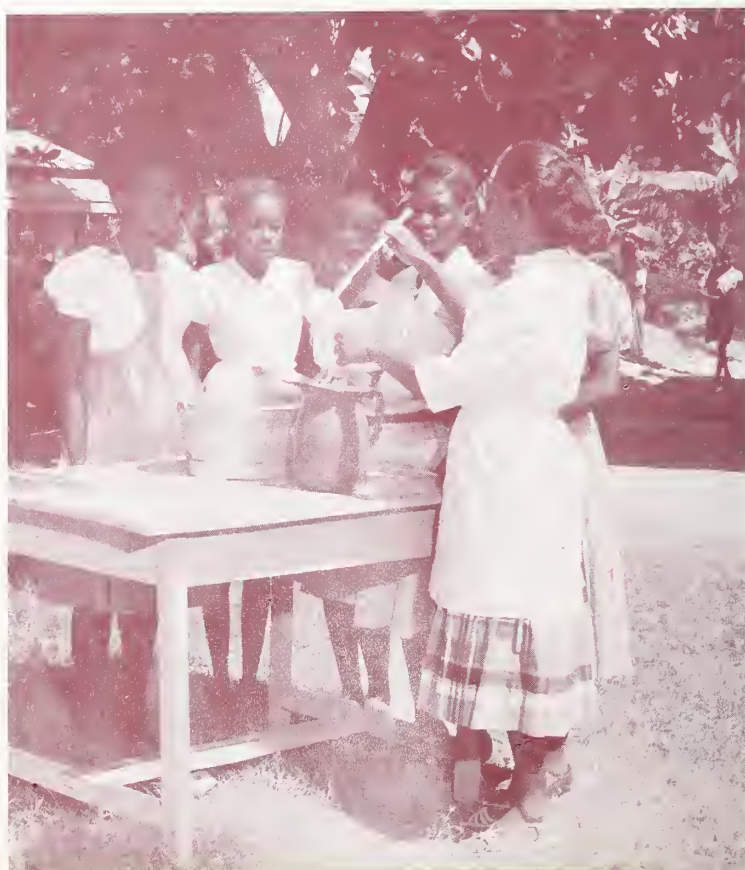
Haitian girls learn to do by doing. They enjoy demonstrating to the other members of their club.