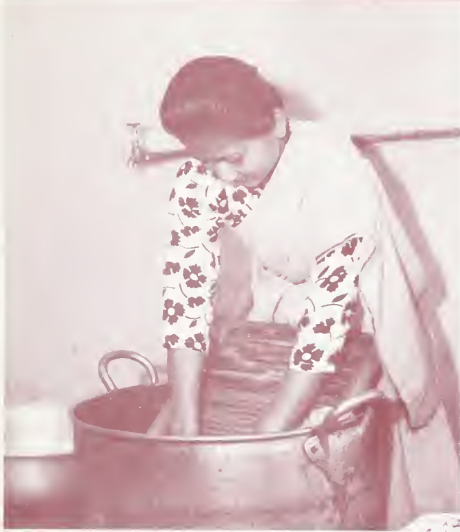
This woman in Nepal is trying out her new bamboo washboard. It will save her energy and make the family's clothing last longer.