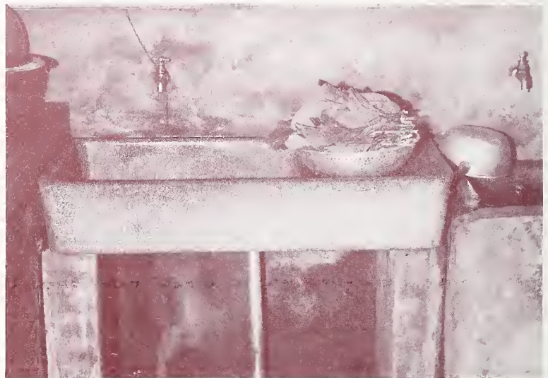
A Taiwan family built a sink to improve their kitchen.