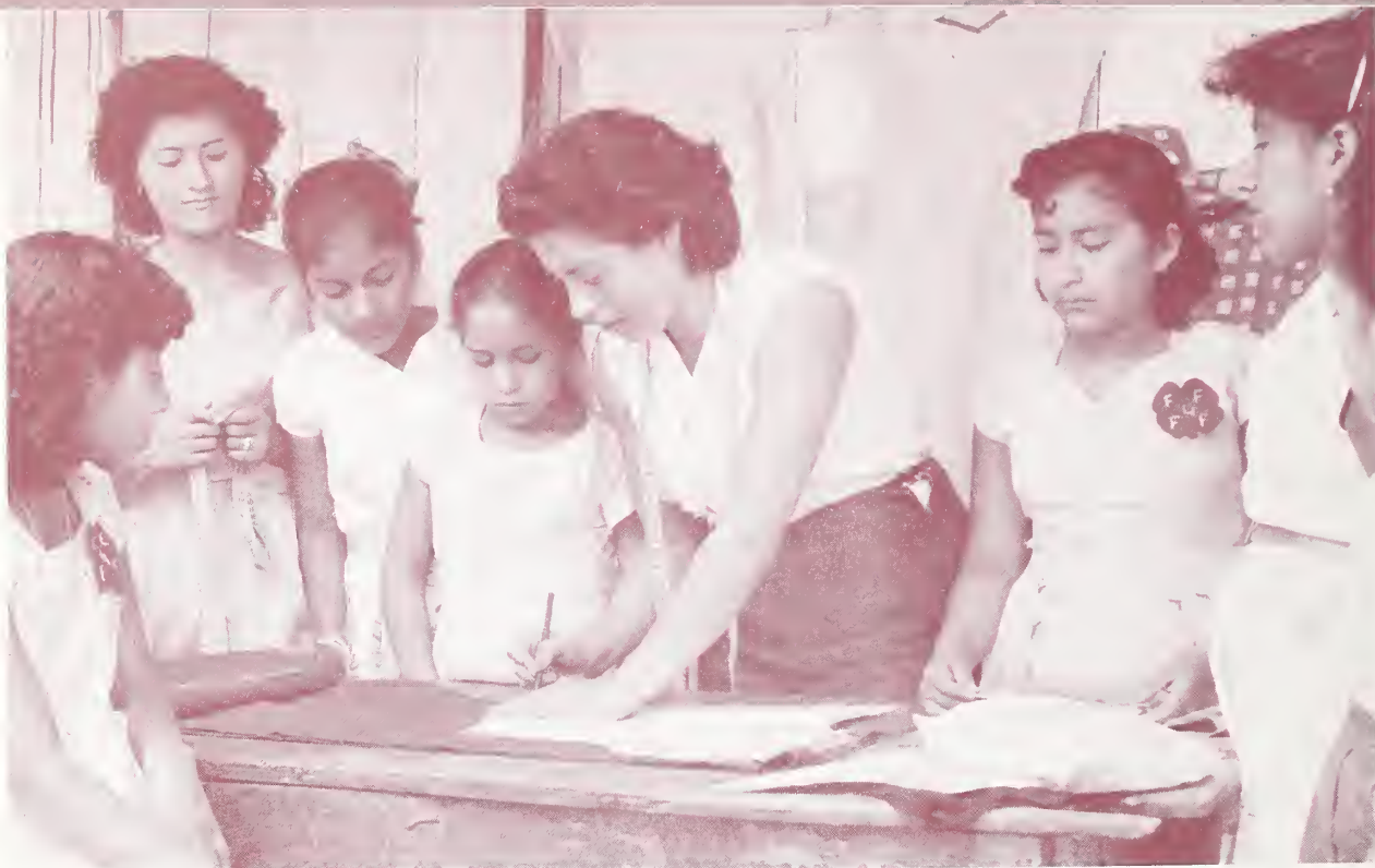
The home agent teaches Ecuadorian girls to make basic clothing for themselves. These girls also learn to make useful articles for their homes.