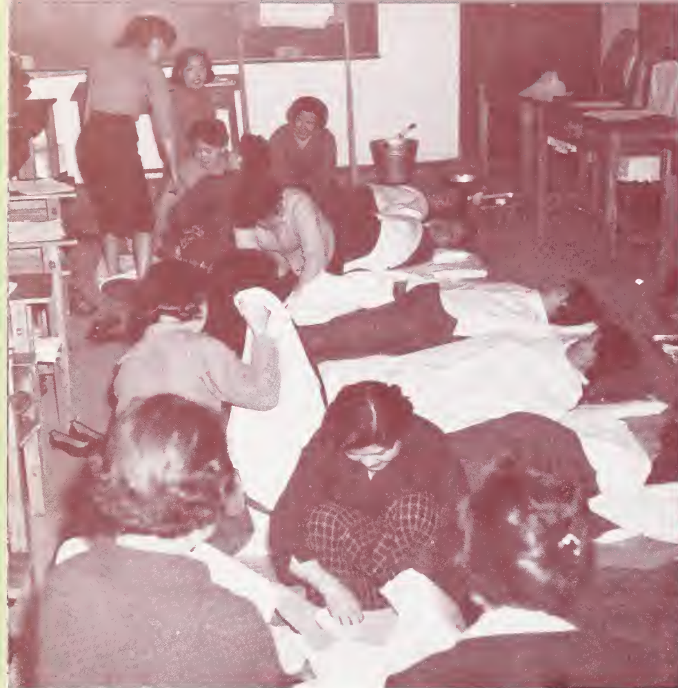
The home agent supervises Korean village women as they learn to give better care to the sick.