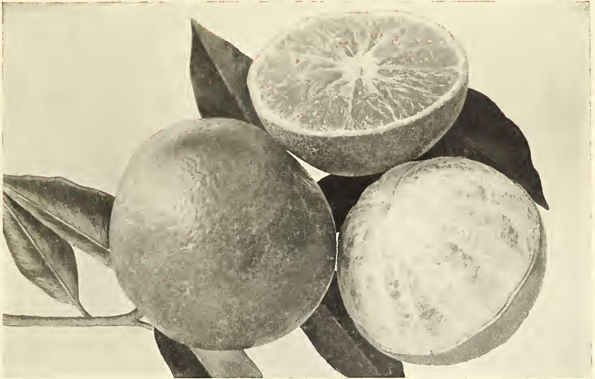
The Skin is Thin and the Flesh Solid