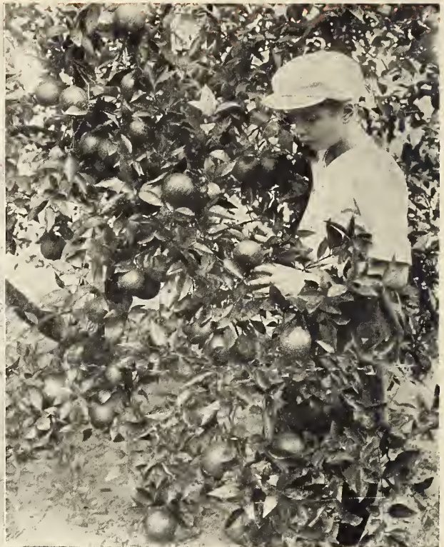
Closer View Showing Fruit