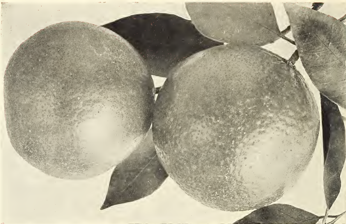
The Outside Markings Are Distinctive