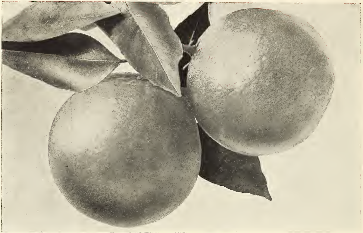
The Temple is A Beautiful Orange