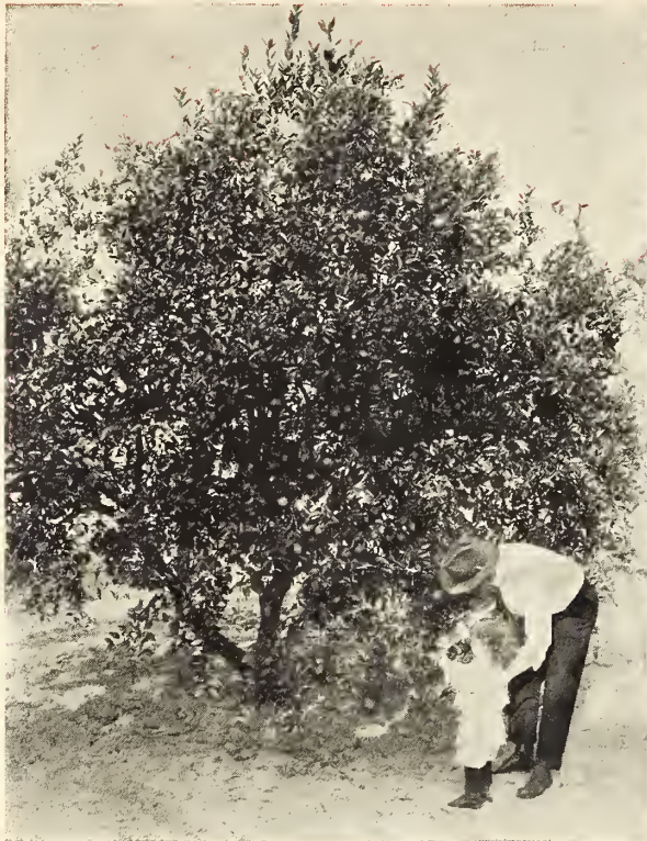
The Original Temple Tree