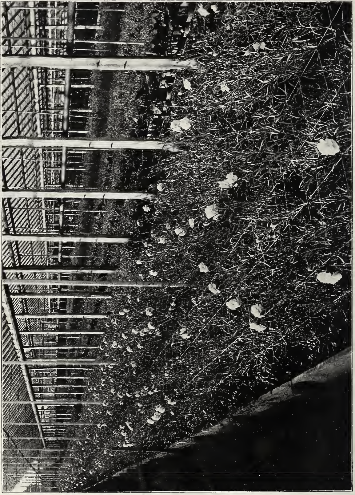
"BED OF HARVESTER"