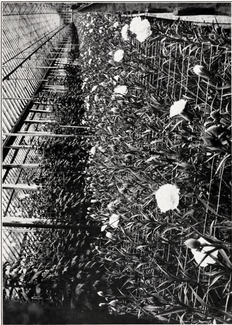
"PATRICIAN" Photographed September 15th