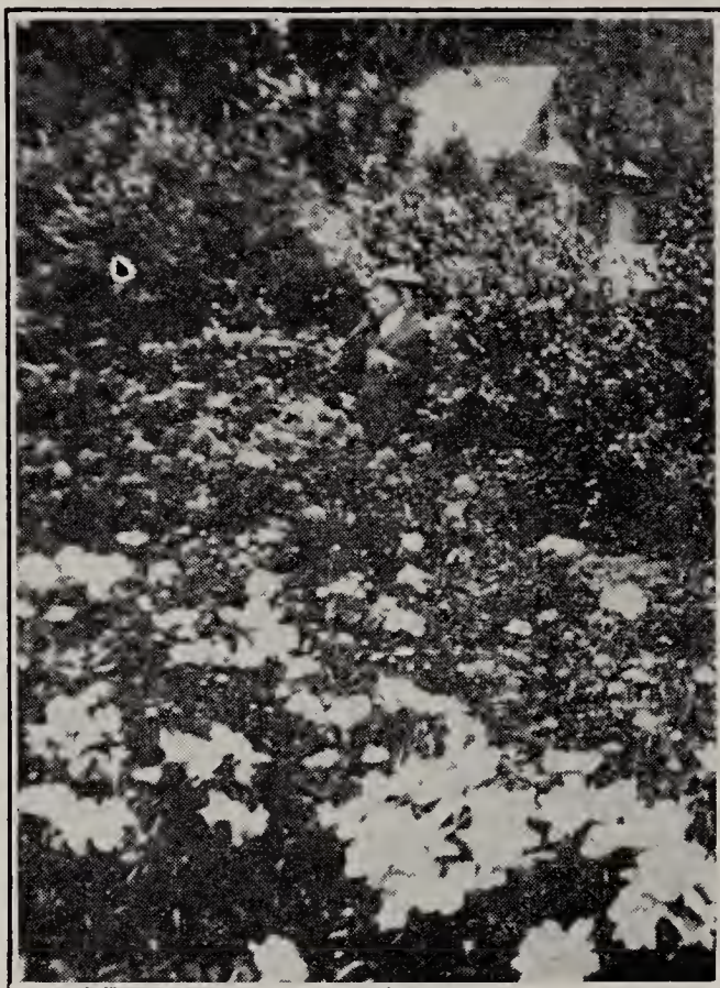
A CORNER OF PEONIES IN THE WASSENBERG GARDENS