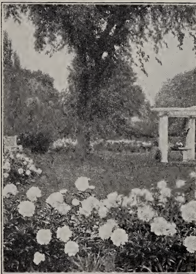
Glimpse of the Wassenberg Gardens