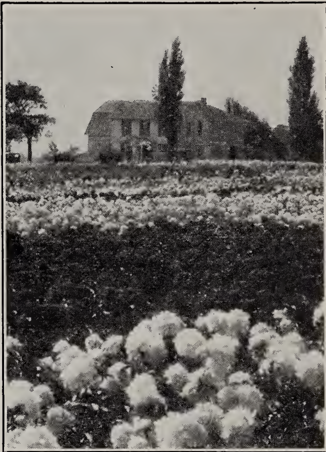
WASSENBERG PEONY AND IRIS FARM Showing Large Blocks of Fine Varieties