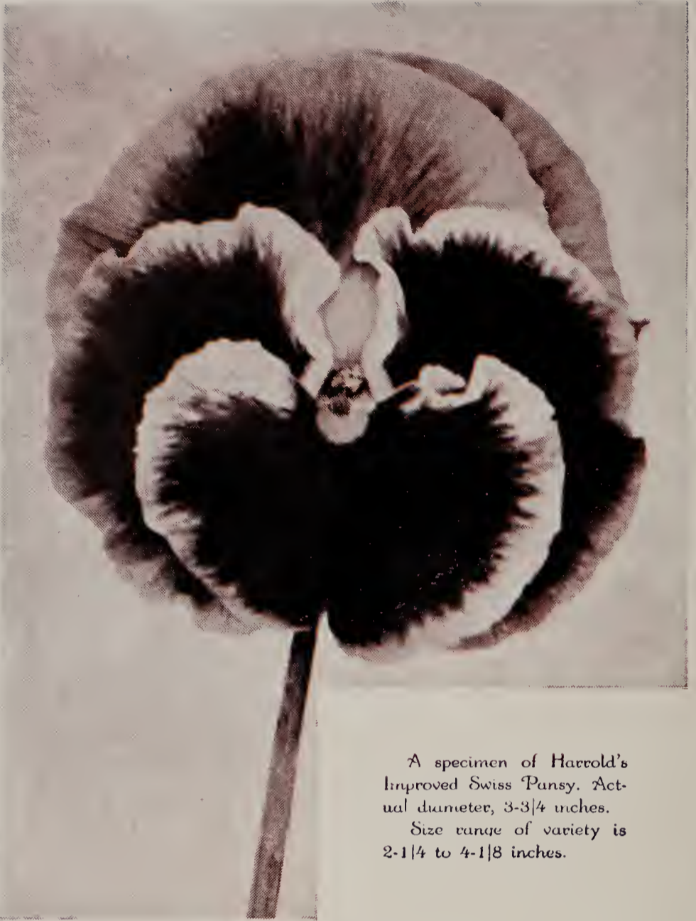
A specimen of Harrold's Improved Swiss Pansy. Actual diameter, 3-3/4 inches. Size range of variety is 2-1/4 to 4-1/8 inches.