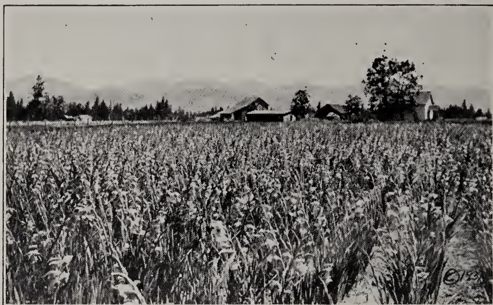
A FIELD OF ROGUE RIVER VALLEY GLADIOLUS