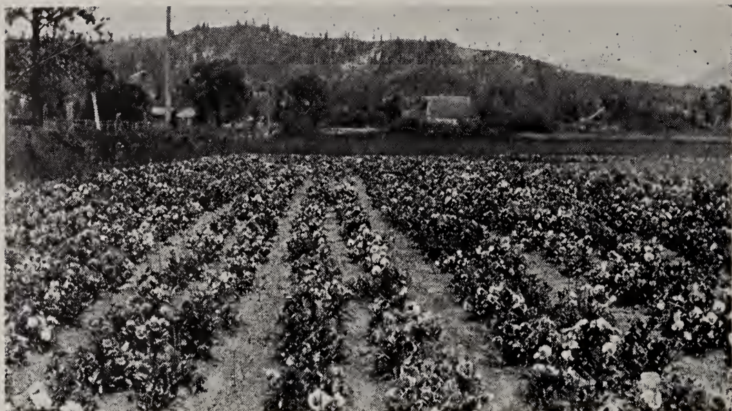
ONE OF OUR SEED PRODUCTION FIELDS IN MAY.