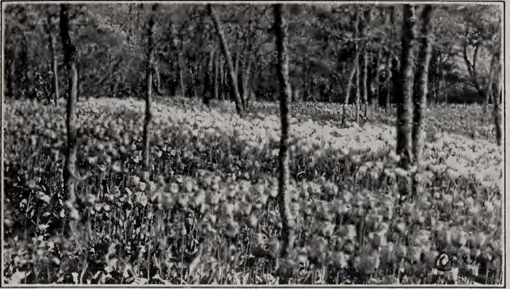
ONE OF OUR TULIP PLANTINGS.