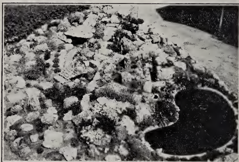
A Part of Our Rockery

On the following pages you will find a list of Rock Plants that are well adapted to even the coldest parts of the country as every item is northern grown and has proven its adaptability to this region. Many varieties commonly called rock plants make excellent edging plants for the perennial border or shrubbery planting.