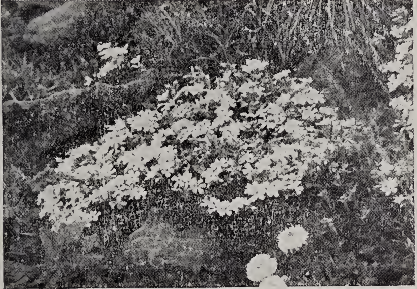
Phlox Subulata in Rockery

Divaricata Canadensis. Our native lavender-blue wood phlox. A showy, easily grown free flowering native for the rock garden or semi-shaded border. Trailing dark green glossy foliage covered in May and June with multitudes of fragrant lavender flowers. A nice plant to use with darwin tulips. Height 10 to 12 inches. Each 15c. .... .40 $1.35