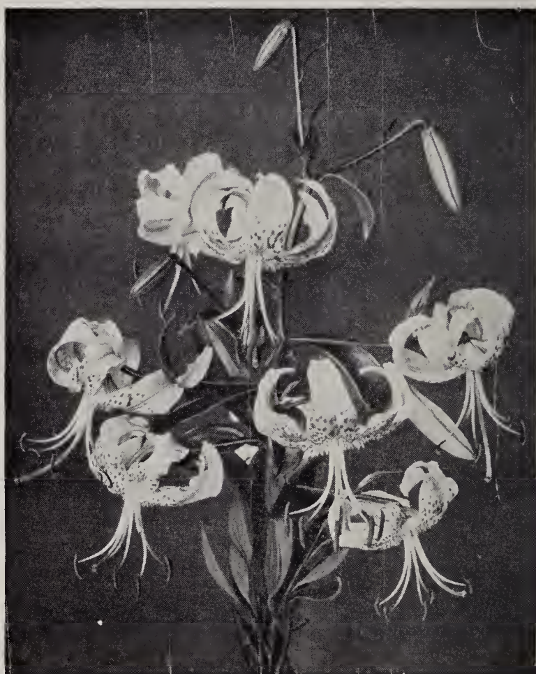
Lily Speciosum Rubrum

Taking lilies generally, they require a bit more care than some other garden plants, but one can easily learn the simple wants of the popular varieties and enjoy them in their own garden. Practically all lilies love leaf-mold. We have found that a mixture of peat, leaf-mold and sand has given excellent results with over twenty varieties. Most varieties prefer some ground cover at the base to protect the feeding roots from excessive heat. A mulch of peat 2 or 3 inches deep is beneficial at all times. Prices are for strong flowering size bulbs.