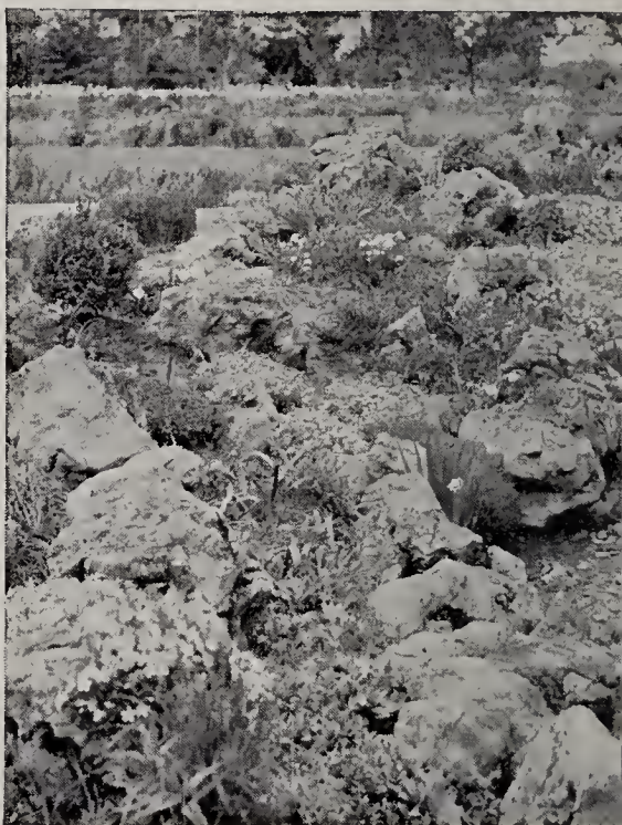
A ROCKERY PLANTING