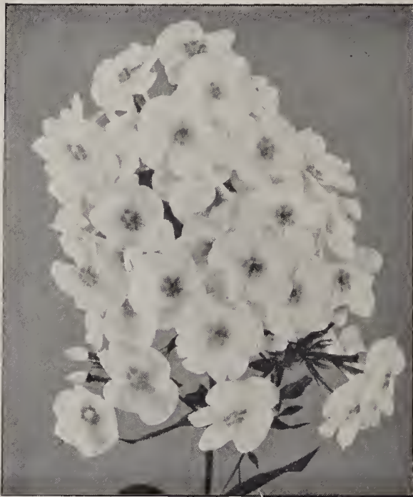
Phlox Count Zeppelin

We are listing eight varieties which we consider to be the best in their respective colors. All strong field grown plants.