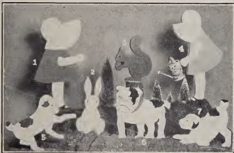
No. 1 The Flower Girl 22½ inches high. Colors: blue and white or red and white. State color wanted. Each $1.50.

Each peace is complete with steel rods to hold ornaments in place.