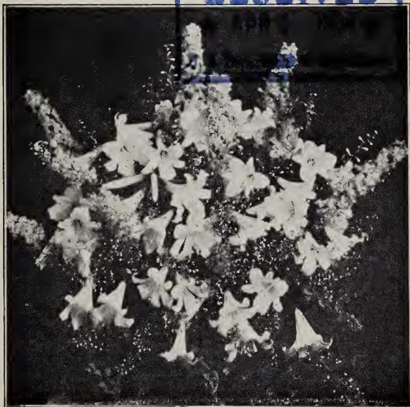
A Gold Medal Basket of Regal Lilies, Heuchera and Delphinium