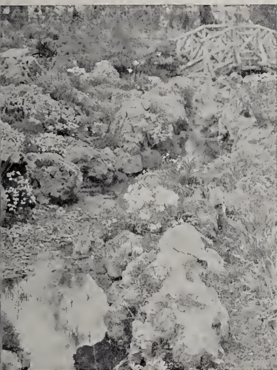
A NATURAL SCENE

Spectabile. Indispensable in the rockery or border with its massive heads of upright rose colored flowers in August and September. A pretty companion plant with almost anything as the foliage is attractive at