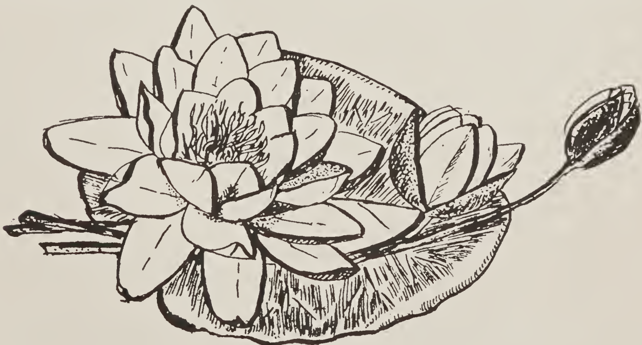
R E D

Here again we are listing only the lilies which we have found to be most satisfactory to the water gardener.