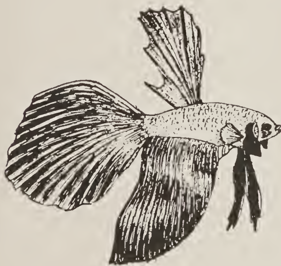
Siamese Fighting Fish

A Happy Family of 50 tropical fishes, will live peacably and keep the pool free from mosquitos ..... $5.00