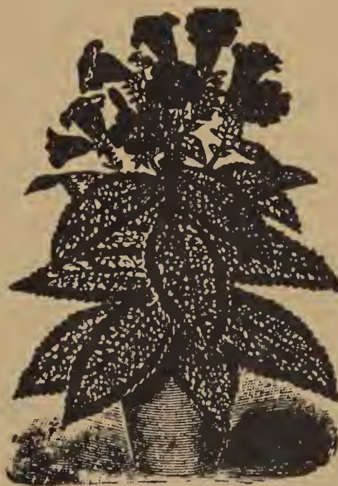
ROYAL PURPLE PLANT

GIANT PINK —Characteristically similar to Mrs. Hill, but with more petalage, and with the deep pink of the calyx heavily veining the corolla. 15c each; 2 for 25c.