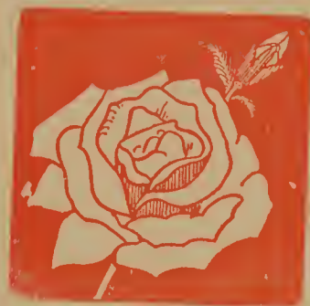
Frances Scott Key

CLIMBING COLUMBIA —A hardy, everblooming pink climbing rose. Buds and blooms immense size; borne on long stems for cutting. Petals large, color clear, imperial pink. Many have been wanting this rose. Each, 15c; two-year, 50c.