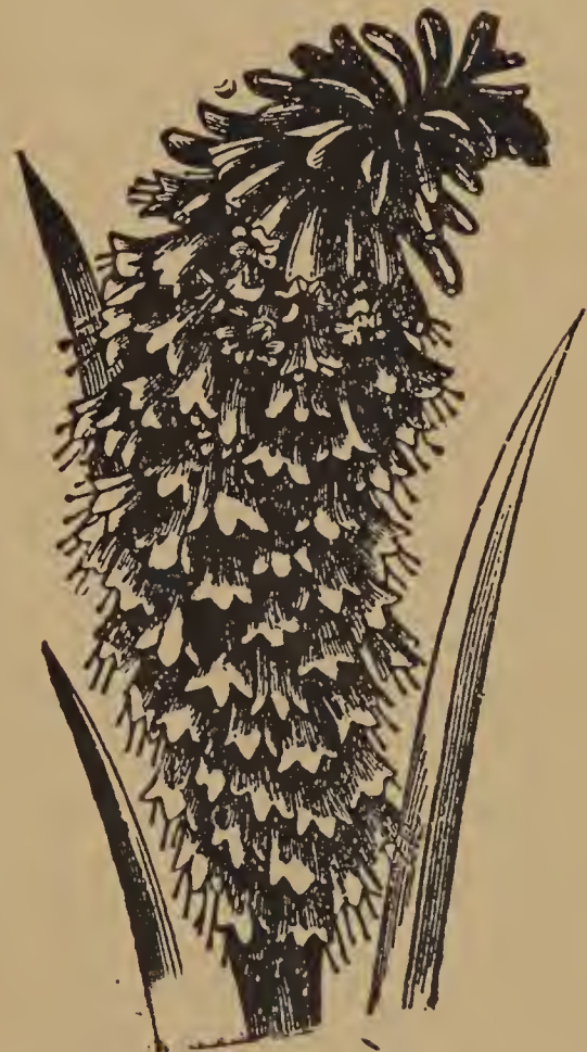
FLAME FLOWER—TORCH LILY

An interesting plant to grow. Planted in the spring in a sunny, well watered location and will grow first season to a height of 10 to 12 feet. Leaves about six feet long. A great novelty to see growing. Very ornamental. Two-year-old plants, sometimes produces a bunch of bananas growing in your yard. Good plants, 35c; 50c and 75c. Store in cellar over winter; will keep without sun or water, keep away from frost.