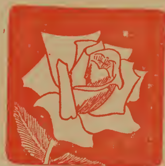
Kiserine Augusta Victoria

JONKHEER J. L. MOCK —Large flowers, erect stems, heavy foliage, quick growth, rich pink; a rose among roses. This is one of our favorites. Price, 20c; two-year, 50c.