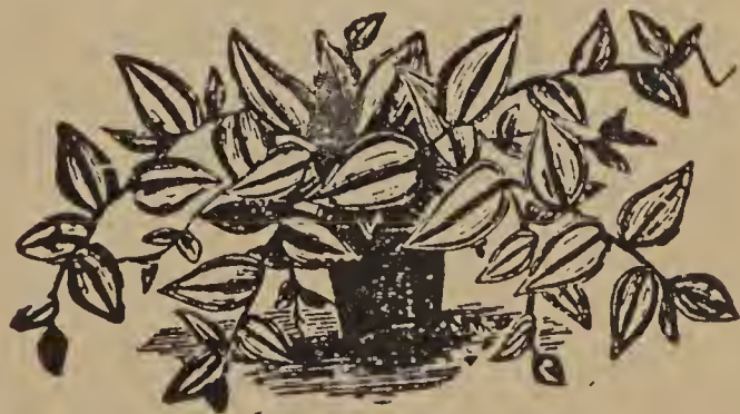
WANDERING JEW (Tradescantia)

This wonderful plant blossoms very early and is usually in shape for Christmas. Crimson scarlet with long drooping flowers borne in great profusion. Stems branching and hanging in bunches. 15c each.