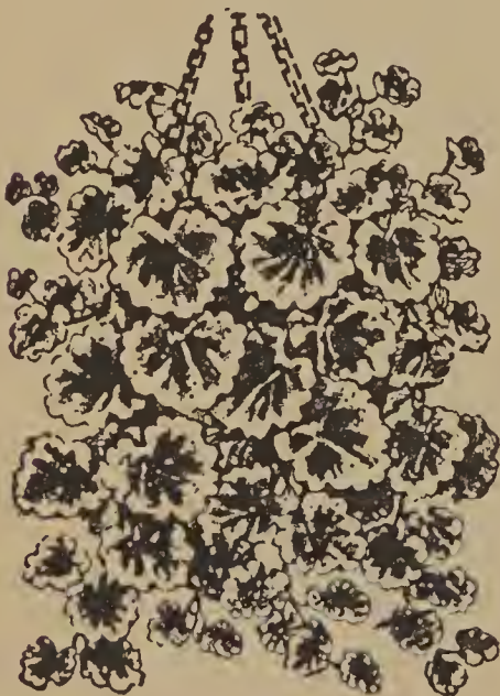
VARIEGATED GROUND IVY —Its green leaves are spotted with white.

For hanging baskets, no trouble; extra fast grower. Price, 10c each; 3 for 25c (Not for outdoor planting)