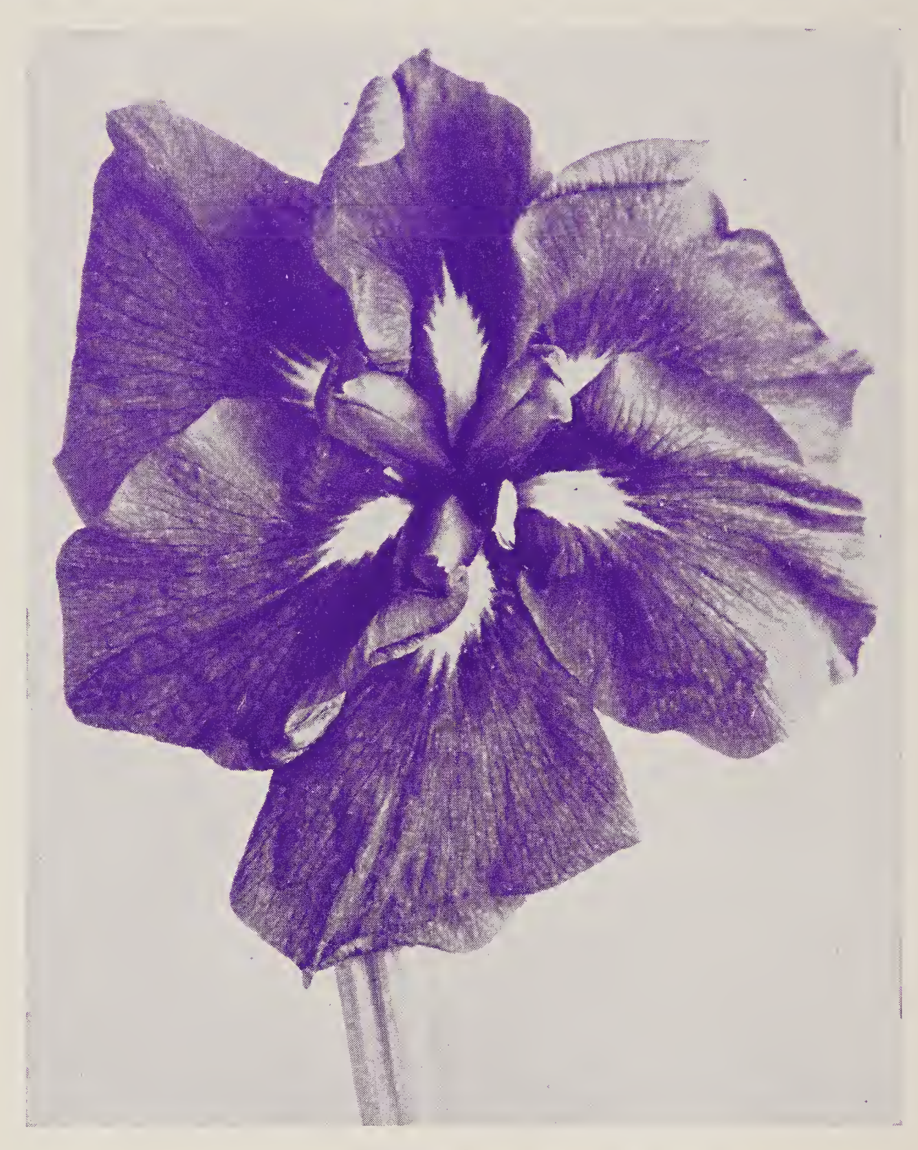
A TYPICAL WHEELER CROFT SEEDLING

Japanese Iris are at home in informal gardens and also they lend themselves to the most rigid and clear-cut formal gardens and bestow upon them form, charm, a most delicate and enchanting beauty, an exquisiteness of texture, and a beauty that is gorgeous and imperious. The large flowers carried well above the foliage, on long stiff stems that never need support, have a commanding air wherever they grow.