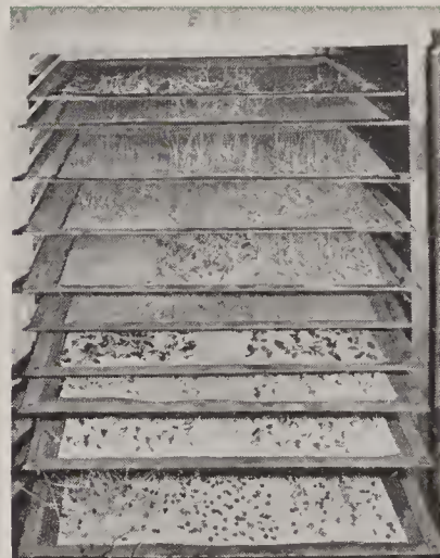
Here is a view inside our electric germinator. It is used to test how Hoffman's Seeds grow.