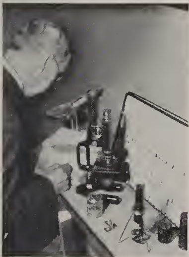
The microscope and magnifiers see what the human eye cannot detect. Hoffman's Seeds are carefully analyzed to avoid weed seeds, and other foreign matter.

That it pays to plant good seed is more than just an idea. The testimony of 30,000 farmers using Hoffman seed through the past 38 years, proves beyond a doubt that if you are careful to plant good seed, you will get bigger crops.