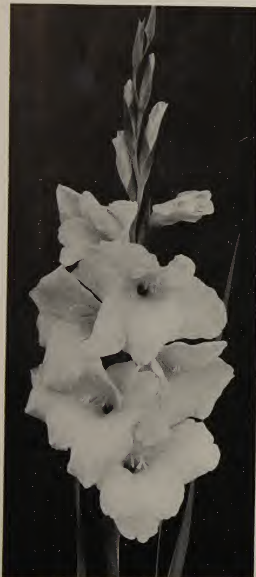
MAID OF ORLEANS