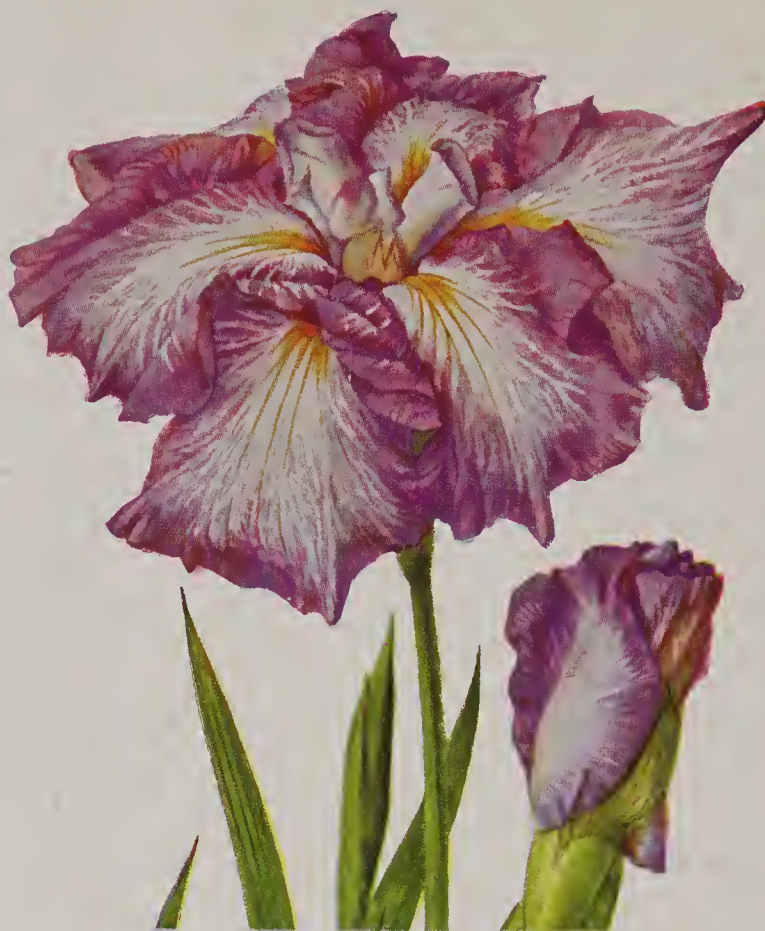
ANNA CASE MACKAY

GEORGE K. MORROW. Double. Clear and purest white with slight yellow markings in center. A flower of wonderful keeping qualities. Each, 50c; $4.50 per 10.