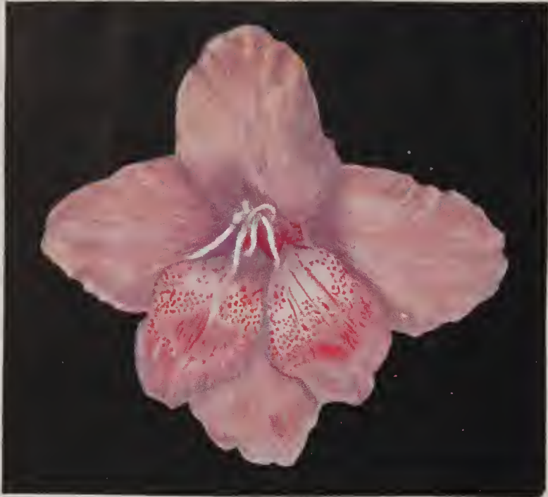
PRINCE OF INDIA