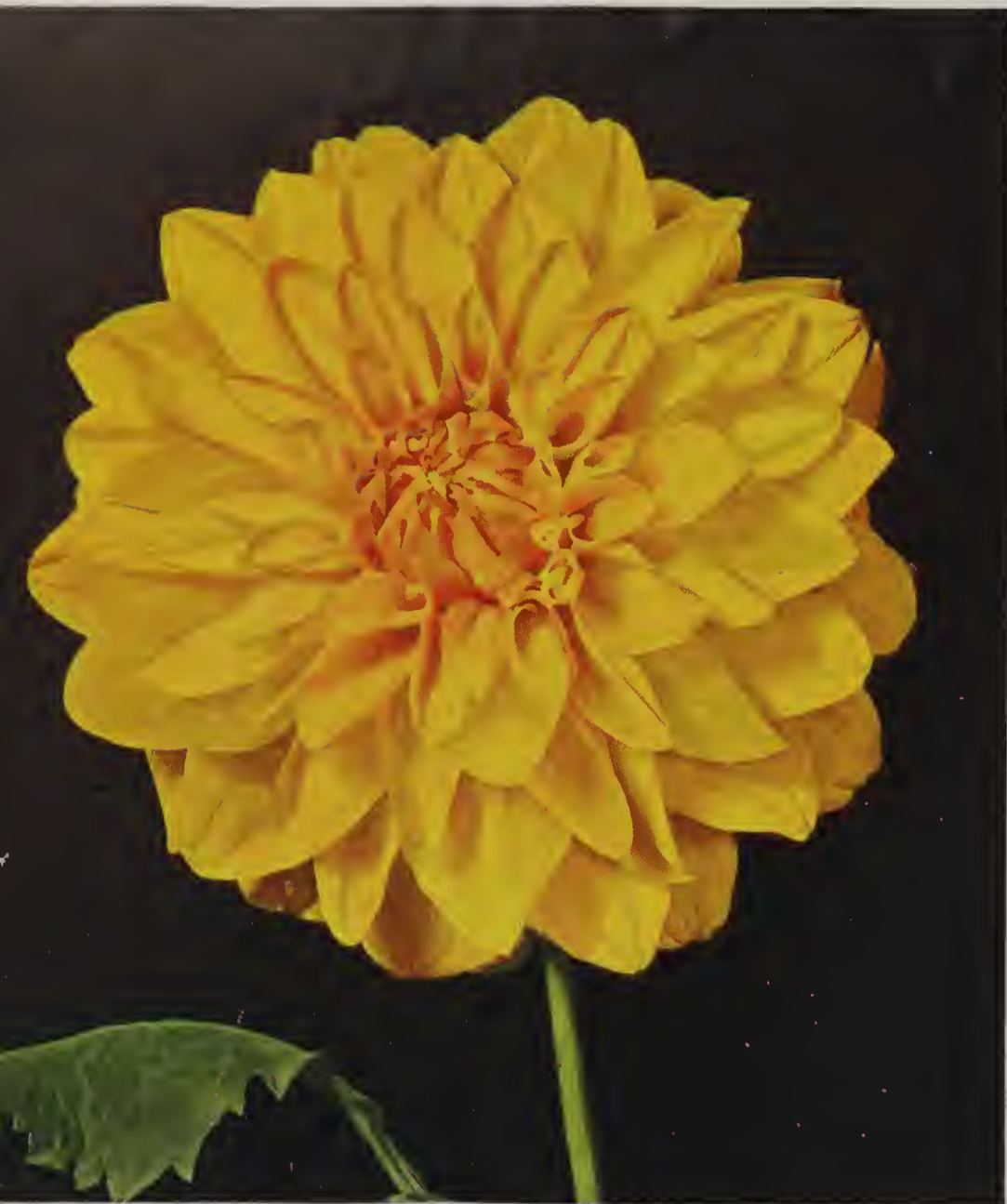
DAHLIA, GOLDEN ECLIPSE