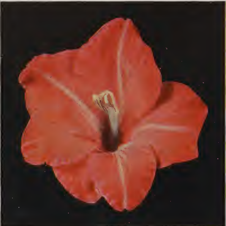
JOHANNES S. BACH