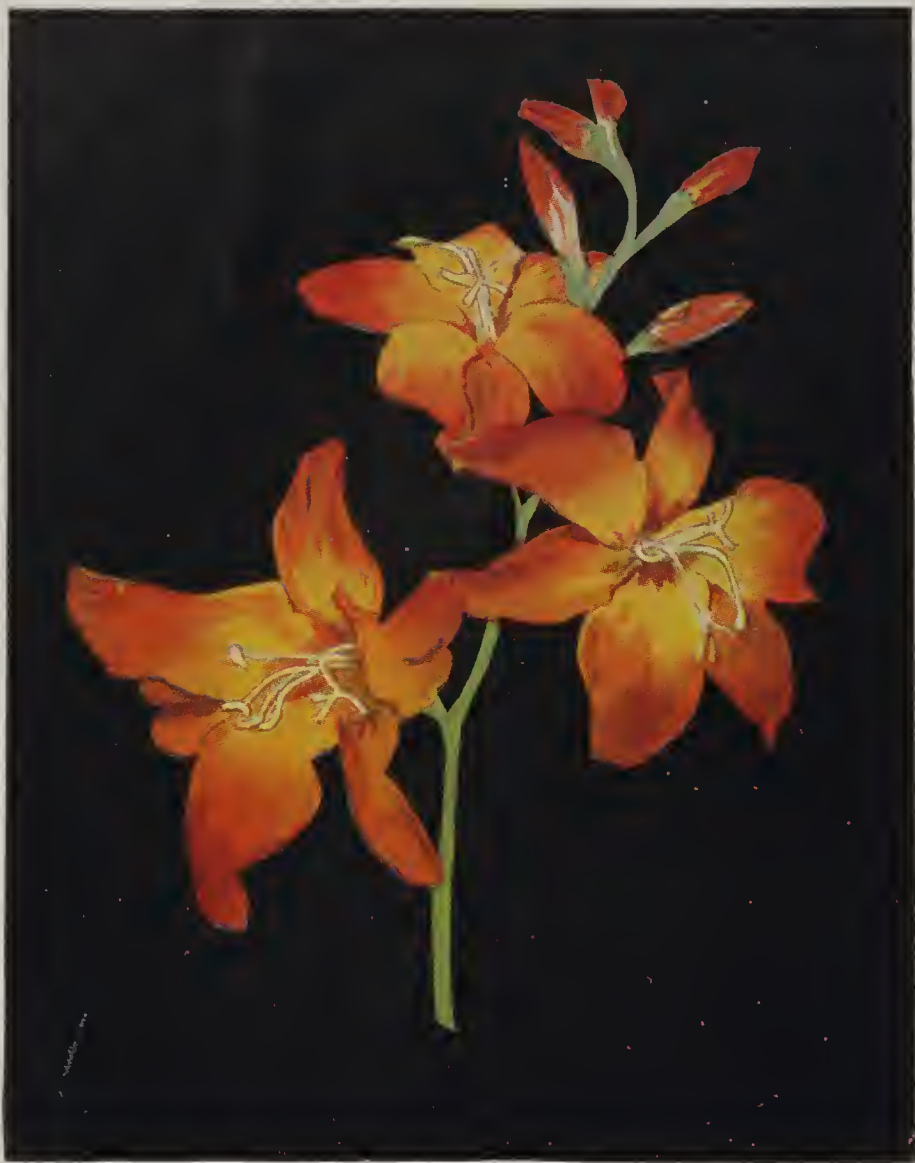
MONTBRETIA, "HIS MAJESTY"

JOAN OF ARC. Flowers very large and open, of perfect form with smooth broad petals, rich, deep golden color, slight crimson markings in center, reverse of petals flushed orange. $2.25 for 10; $20.00 per 100.