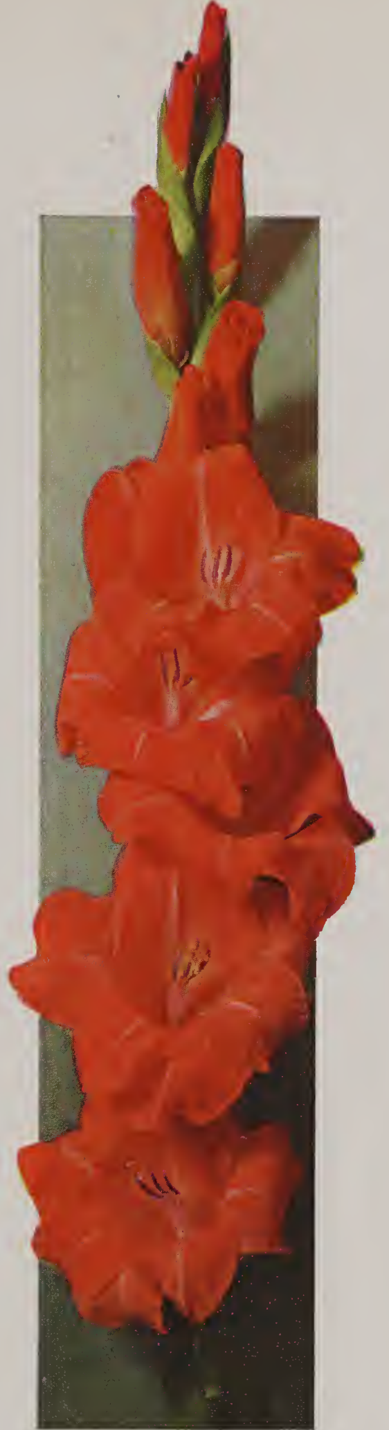
RED PHIPPS $1.00 for 10 7.50 per 100