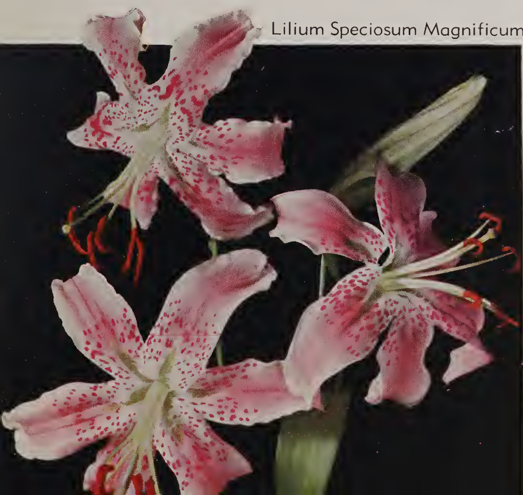
Lilium Speciosum Magnificum

LILIUM REGALE (The Regal or Royal Lily). Of all the Lilies in cultivation, this is one of the most beautiful, hardiest, and easiest to grow. Flowers in July. Worthy of a place in every garden. The bulbs which we offer are carefully selected as to trueness to original type. This is important.