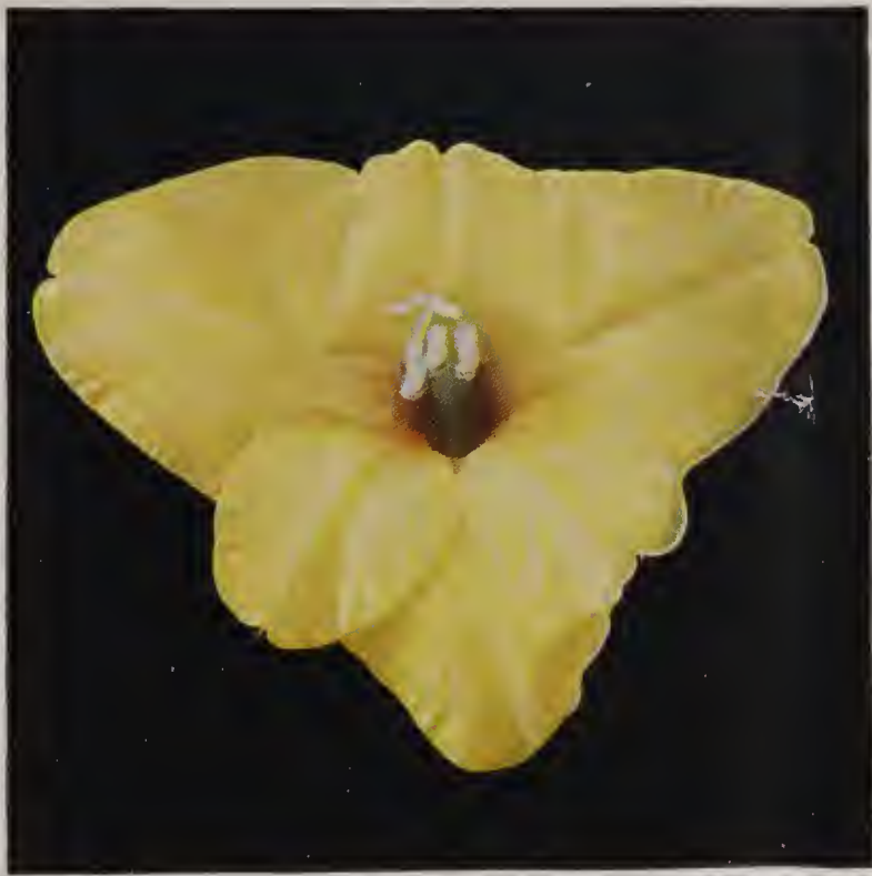
GATE OF HEAVEN