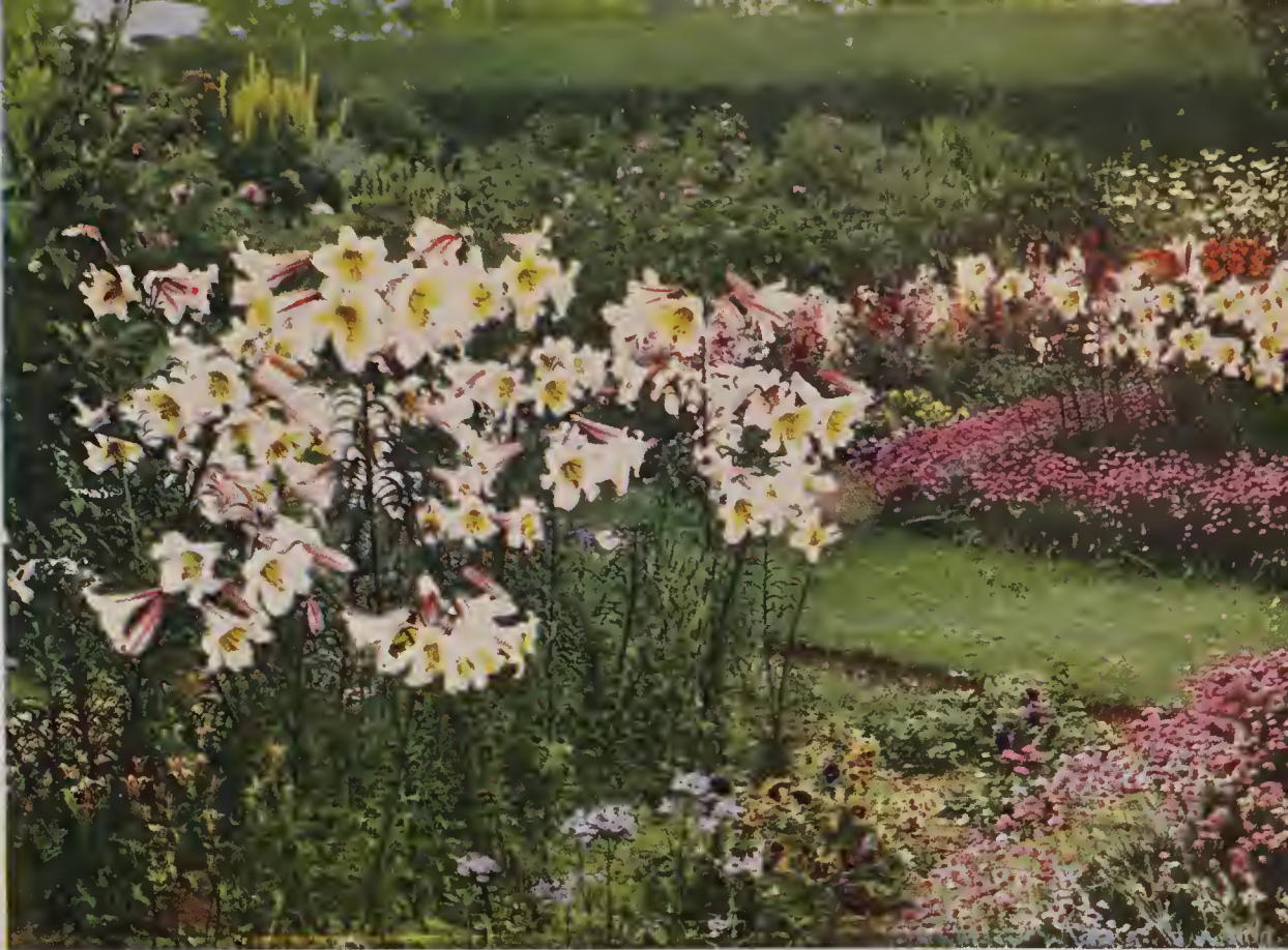
Lilium Regale in the Garden of One of Our Clients

SO THAT you may succeed with these inspiring plants and to obviate disappointments we offer from a host of varieties, the limited few that will succeed in American gardens under ordinary care if planted in spring. These varieties have been selected after many years of experimenting and testing. For other varieties of the garden aristocrats that are suitable for fall planting only, please consult our 1938 edition of "Beauty from Bulbs" available in May.