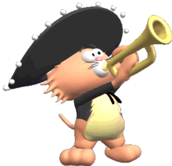
A trumpet cat