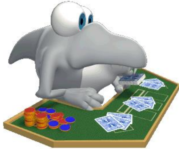
A card shark