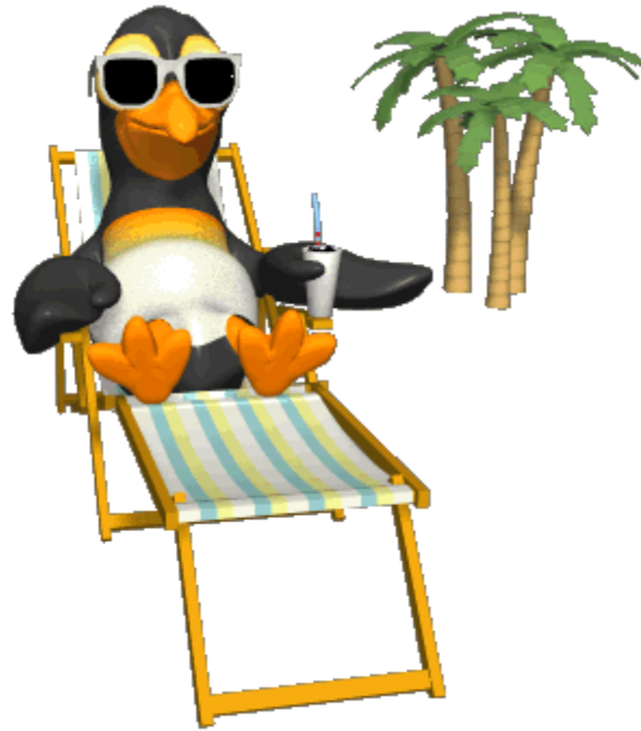
A penguin on vacation