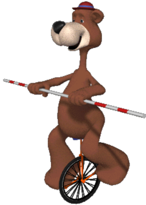
A unicycle bear