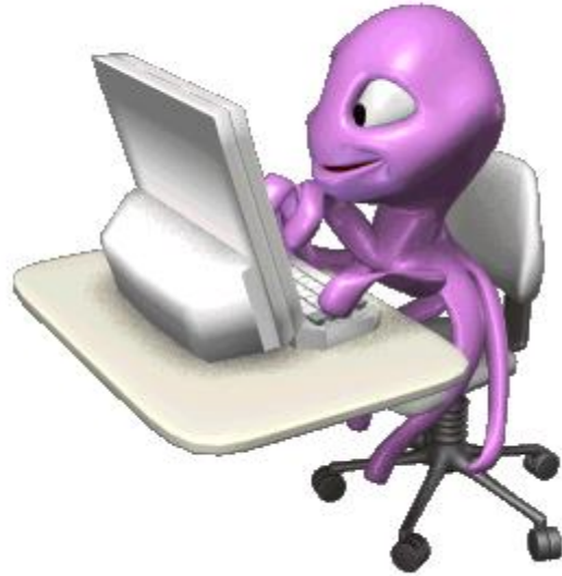
A typing octopus