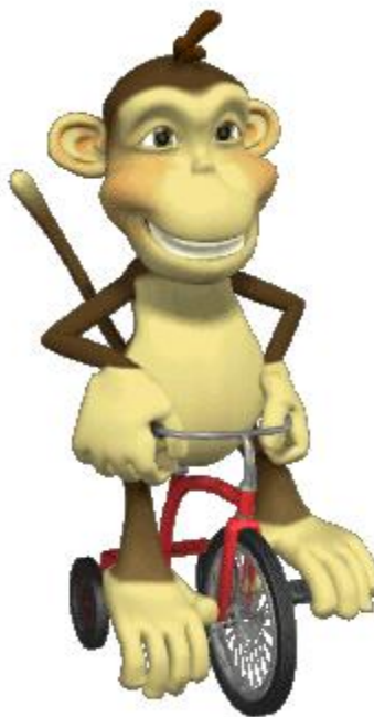
A tricycle monkey