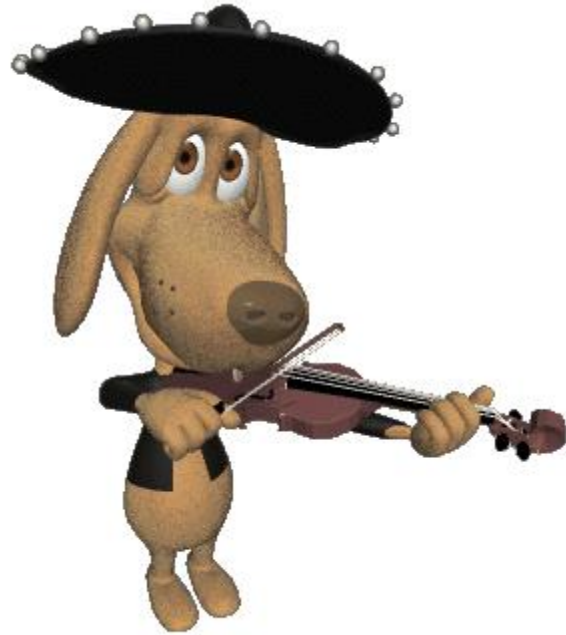
A violin dog