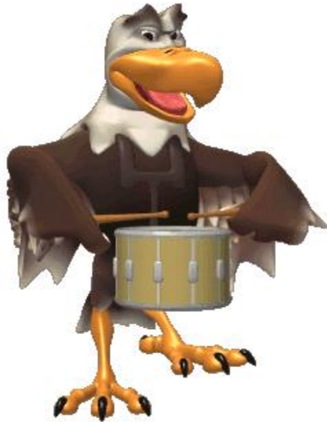
A drummer eagle