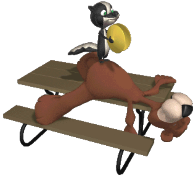
A cymbals skunk