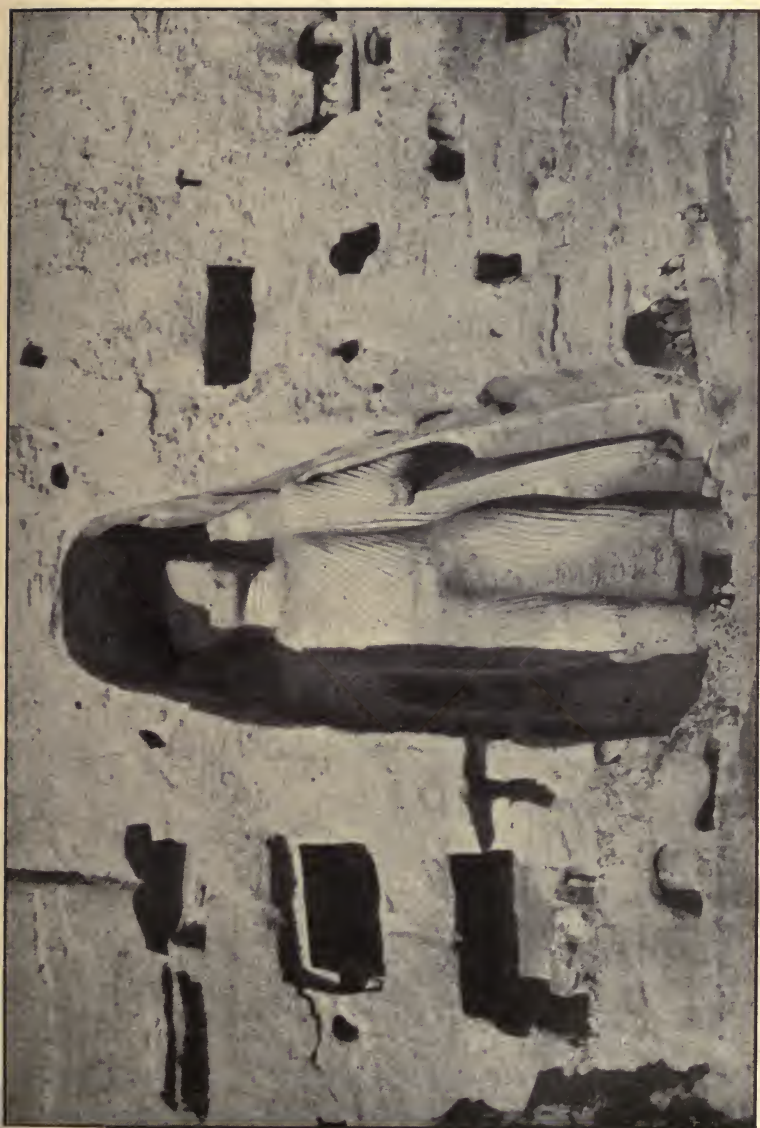
COLOSSAL FIGURE, "SA-MAMA," IN THE BAMIAN VALLEY.