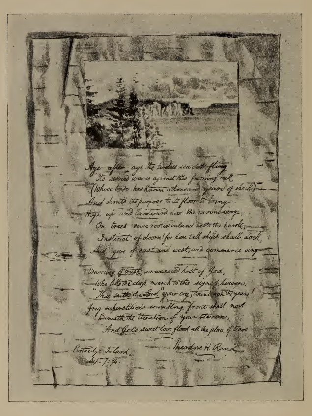
Reduced fac-simile of original of page 42.