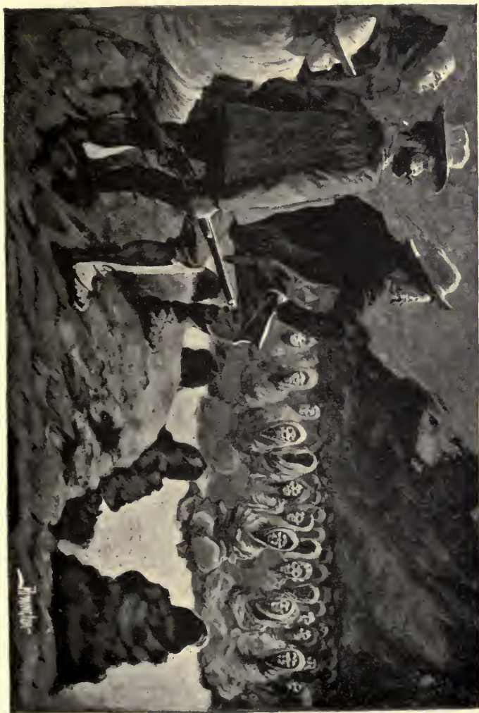
THE GATE OF THE DEAD.