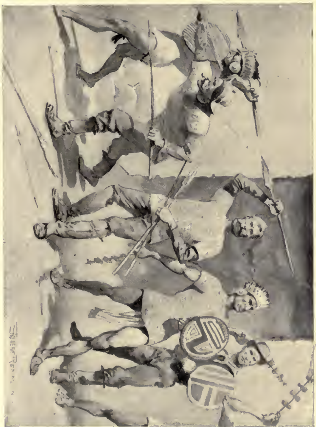
THE LAST RALLY.