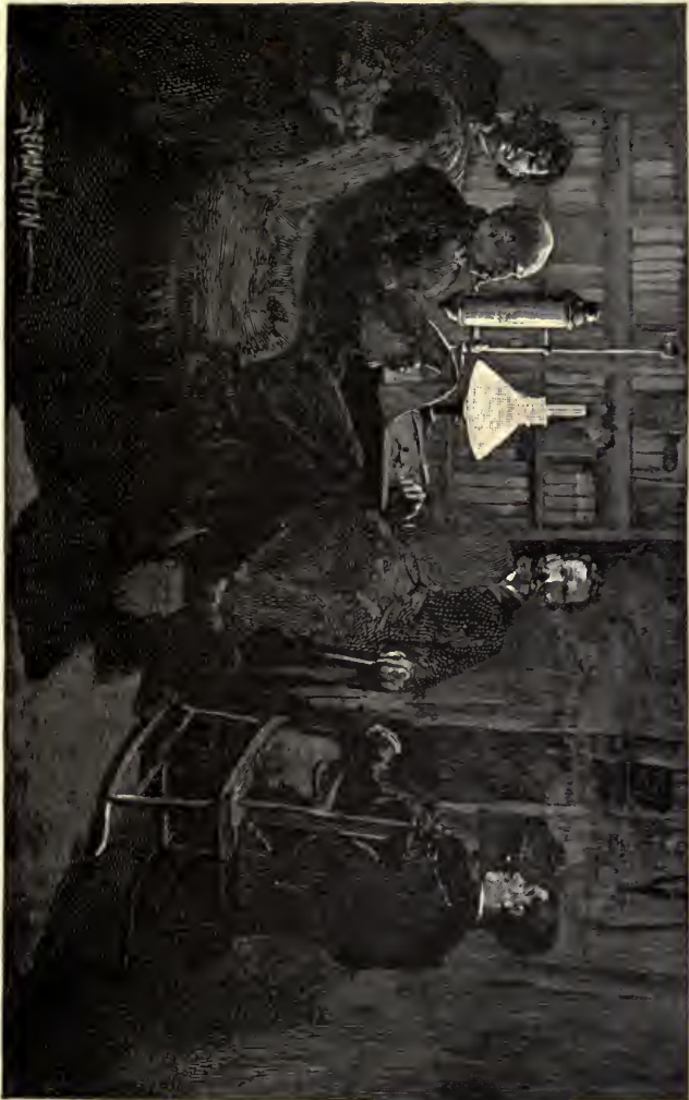
IN THE LIBRARY BEFORE THE OPEN FIRE.