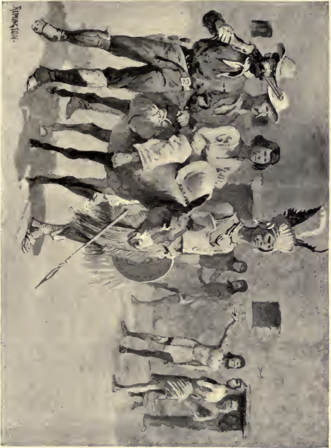
THE FULFILMENT OF THE PROPHECY.