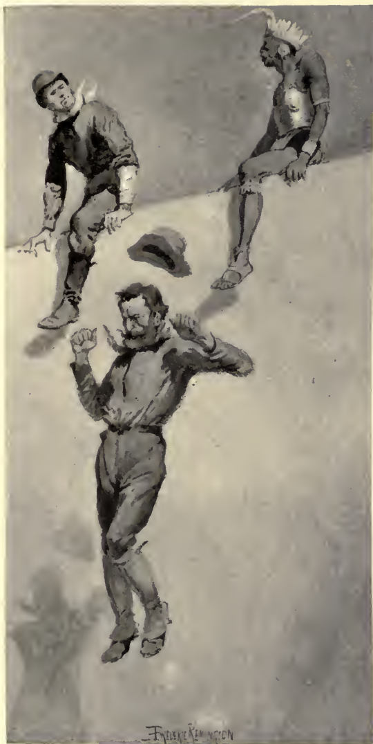
THE LEAP FROM ABOVE THE WATER-GATE.