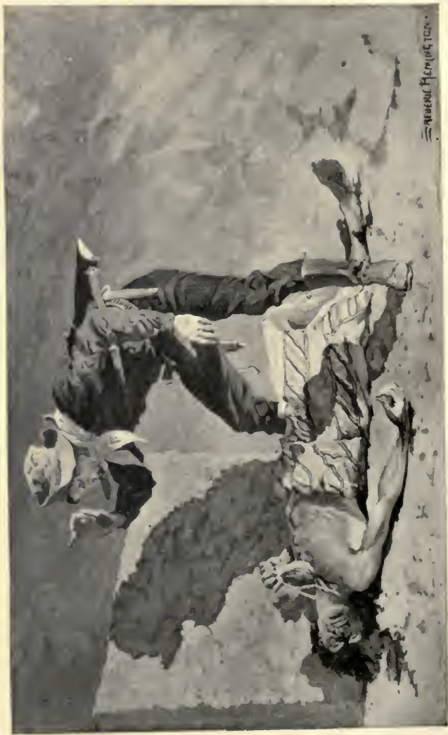
THE DYING CACIQUE.