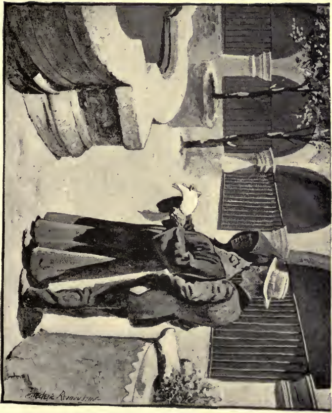
THE LETTER FROM THE DEAD.