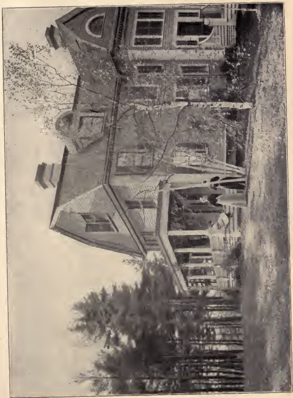
TARRYAWHILE, MR. CABLE'S HOME, NORTHAMPTON, MASS.