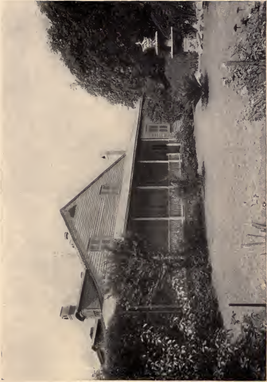
THE HOUSE ON ANNUNCIATION SQUARE, NEW ORLEANS, IN WHICH MR. CABLE WAS BORN.