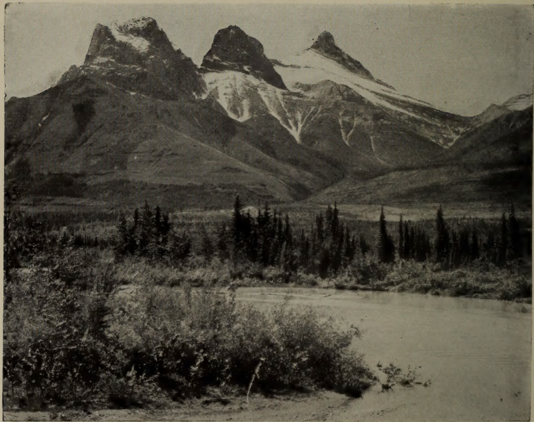
"High, high the hoary Mountains tower"