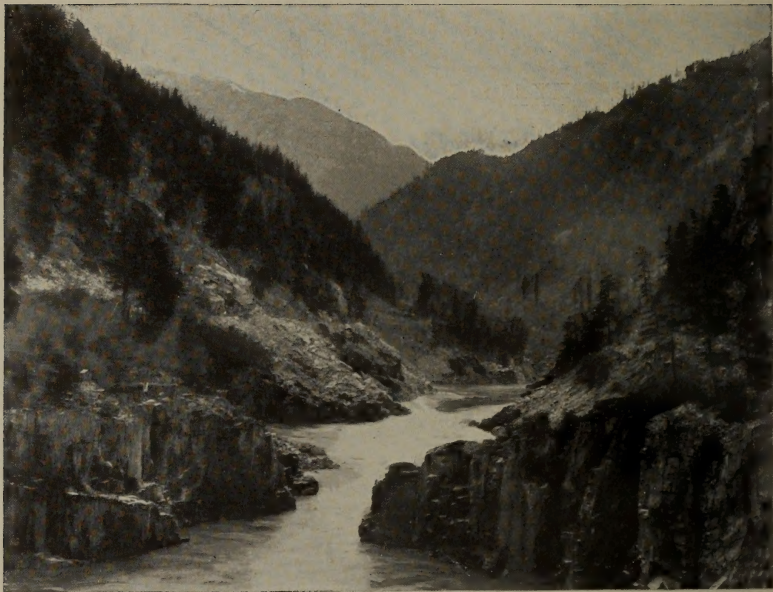
"Thro' scenes sublime"