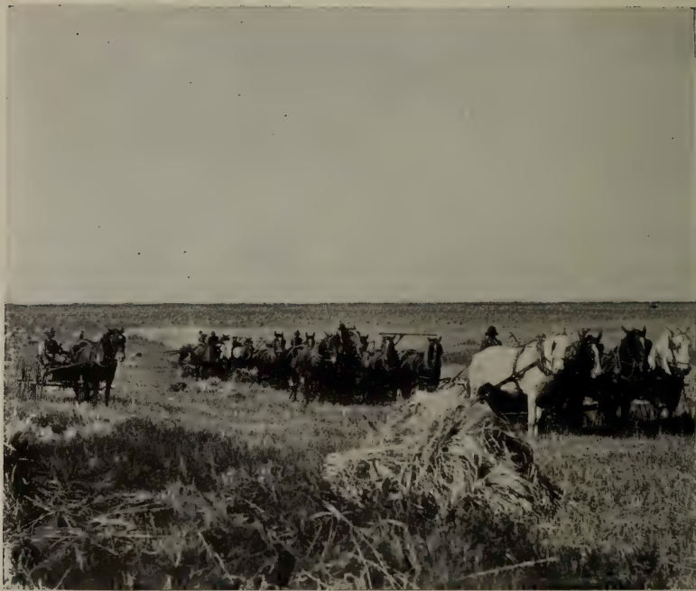
"Thy Prairie-breast is wealth untold"