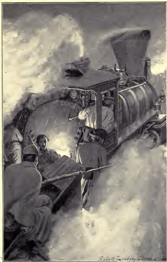
FULLER WAS STEAMING TO THE NORTHWARD WITH "THE YONAH"