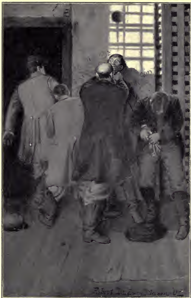
WATSON PLACED HIS HAND OVER THE MAN'S MOUTH