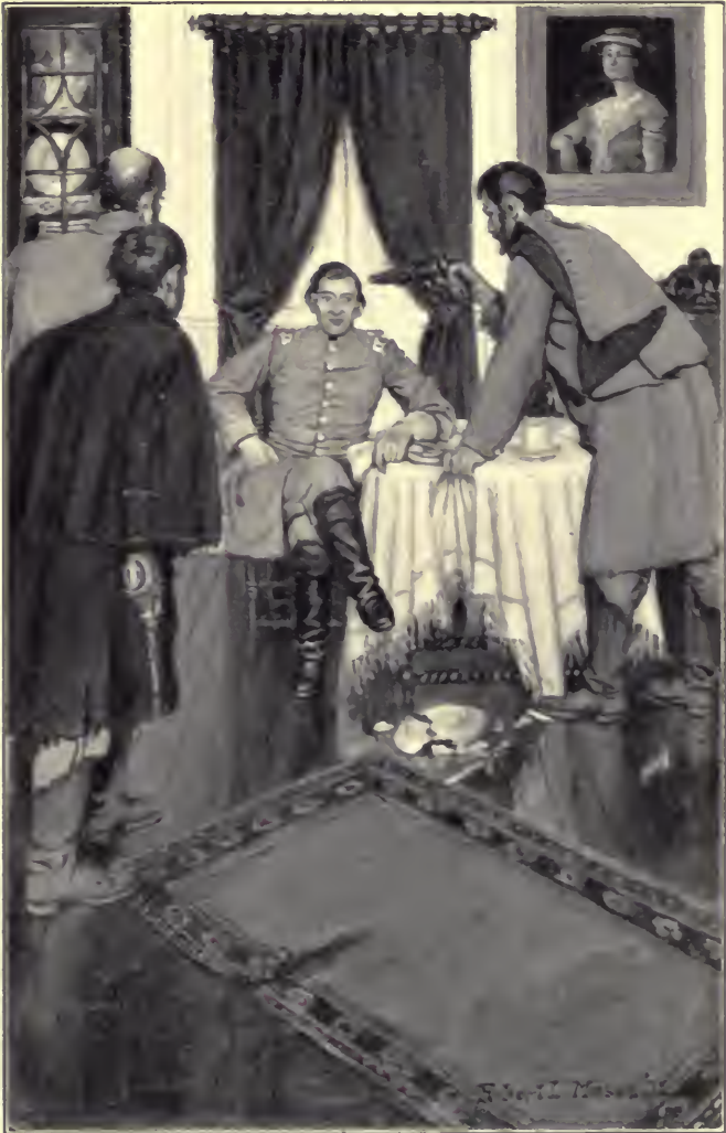
THE MAJOR MERELY CHANGED THE POSITION OF HIS LEGS