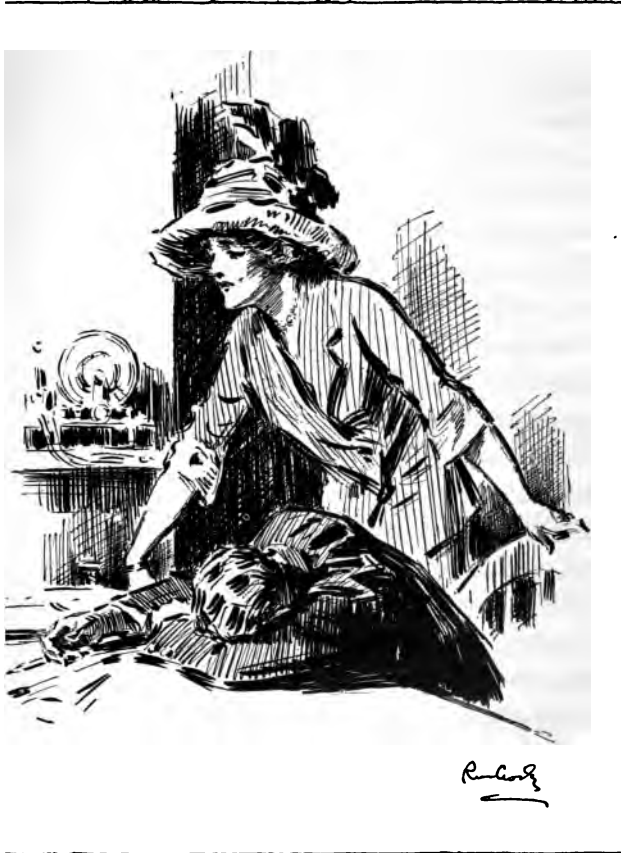
She read of the murder of the Earl of Roakby