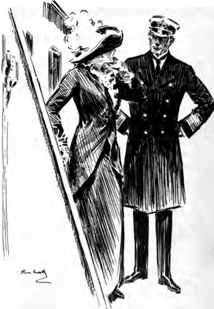
She turned to him with a face full of childlike simplicity