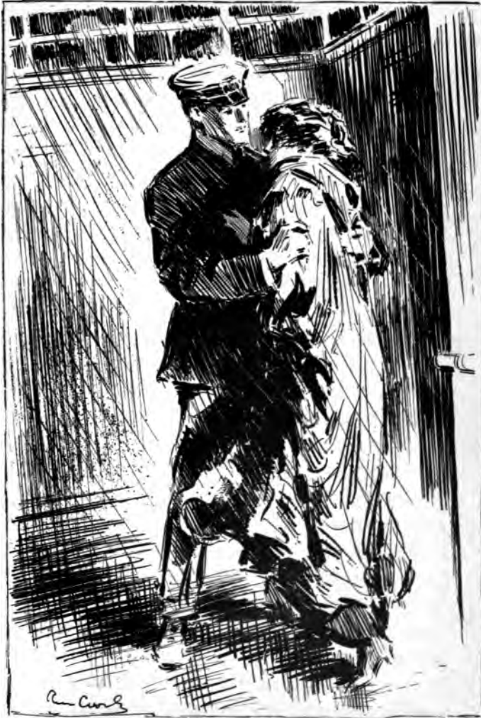
Before he knew it he had taken her in his arms