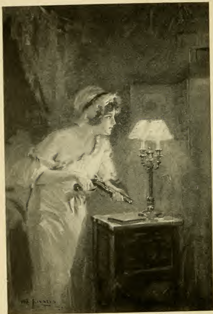
The Little Countess takes Arms for Her Defence. Page 250 The Eagle of the Empire.