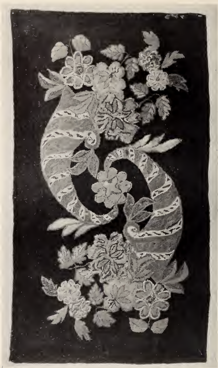
EARLY AMERICAN HOOKED RUG OF FINE TEXTURE