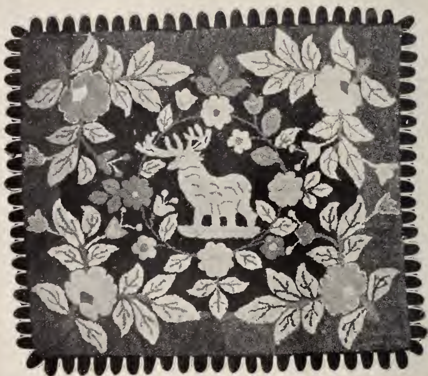
TWO FINE EARLY AMERICAN HOOKED RUGS [ NUMBERS 95 AND 105 ]