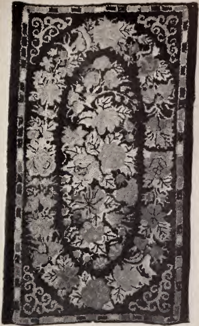
EARLY AMERICAN ALL WOOL HOOKED RUG