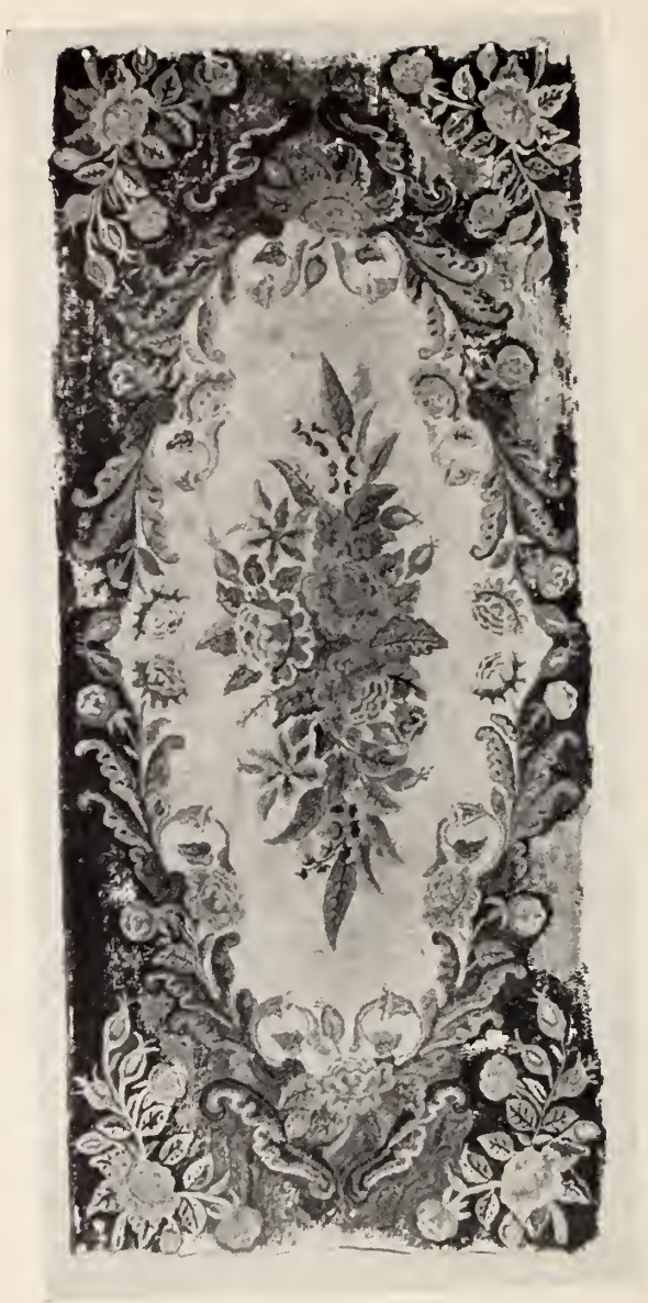
FINE EARLY AMERICAN RUG HOOKED ON LINEN