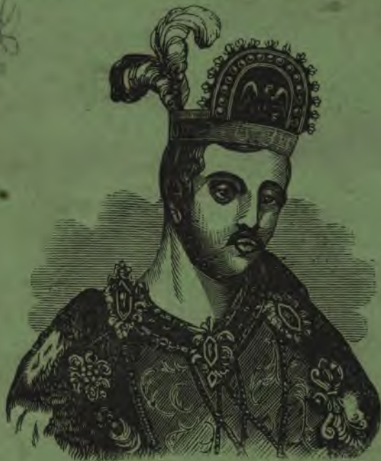
MONTEZUMA, THE LAST AZTEC EMPEROR.