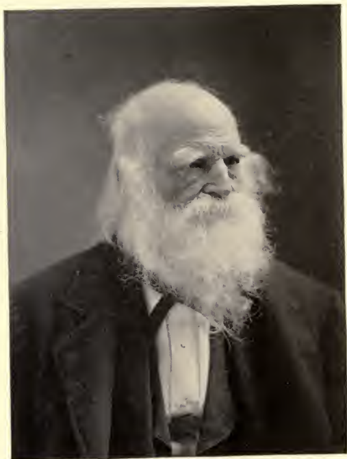
WILLIAM CULLEN BRYANT.