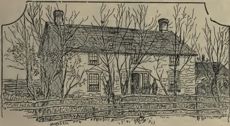
MANITOBA COLLEGE (1871-2).