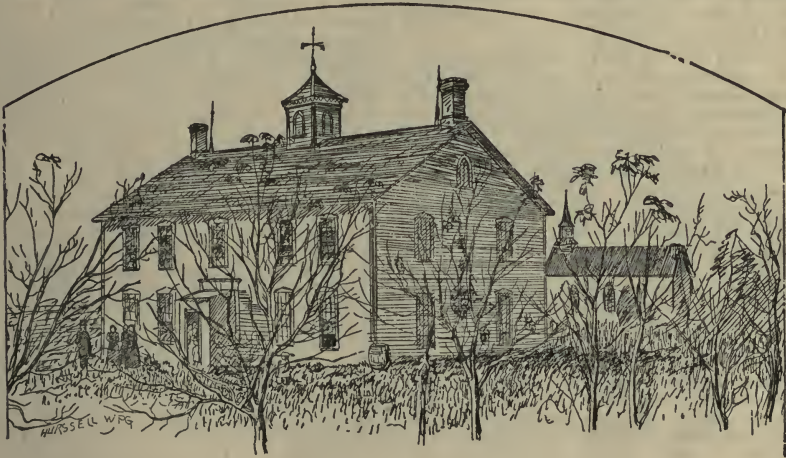
MANITOBA COLLEGE (1872-4).

Early in January (1875) during the session the first public educational meeting ever held in Winnipeg took place under the auspices of the college. The "Daily Free Press" of January 9th devotes two columns and a-half, its whole editorial space, under the heading "Collegiana," to an account of the meeting. The meeting was held in the court house, a building on Main street, near where Ryan's