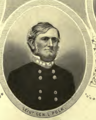
LEIUT. GEN. L. POLK.