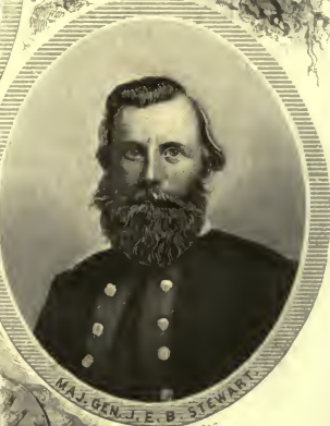
MAJ. GEN. J. E. B. STEWART.