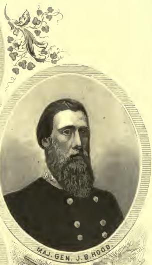
MAJ. GEN. J. B. HOOD.