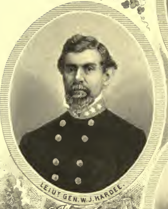
LEIUT. GEN. W. J. HARDEE.