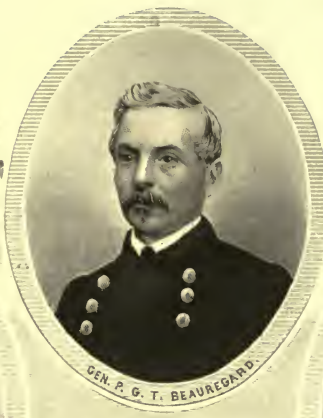
GEN. P. G. T. BEAUREGARD.