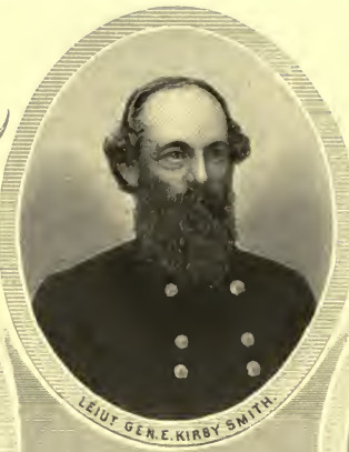
LEIUT. GEN. E. KIRBY SMITH.