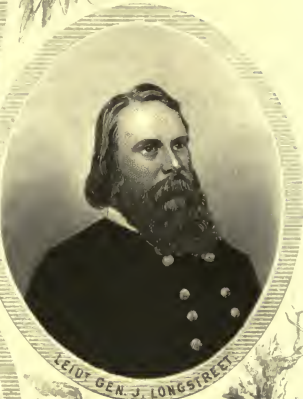
LIEUT. GEN. J. LONGSTREET.