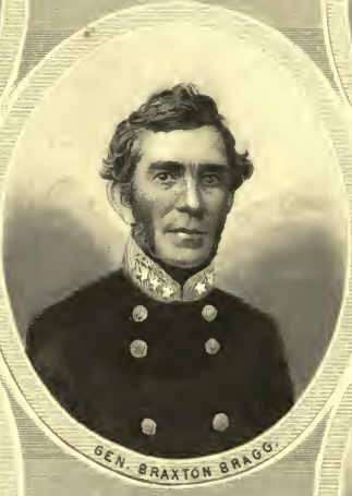
GEN. BRAXTON BRAGG.