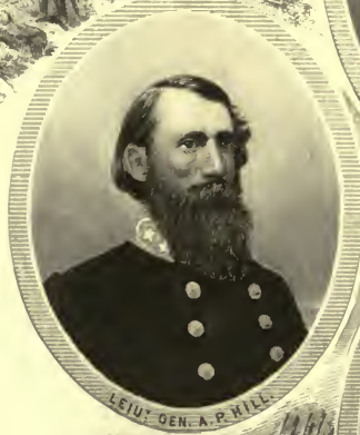
LIEUT. GEN. A. P. HILL.