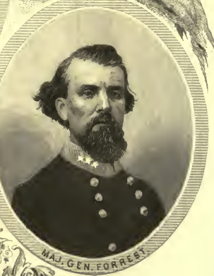
MAJ. GEN. FORREST.