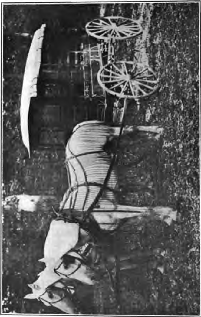
William Rarig's Team of Grays. Figure 39.