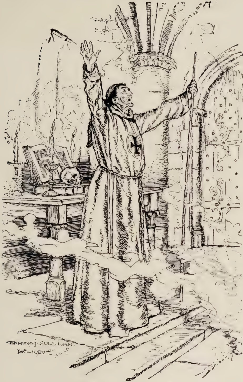
THE FIGURE OF A TALL MAN.