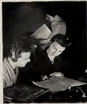
Students follow a score while listening in the Library.

SUCCESSFUL COMPLETION of the three-year course in the Senior School leads to the Artist's Diploma of the Royal Conservatory of Music of Toronto.