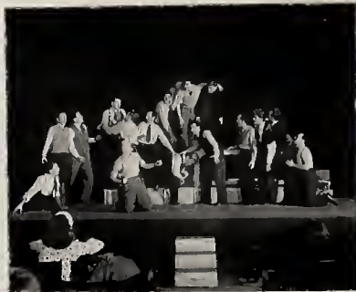
The Opera School's male chorus tries out groupings for Hart House performance of "Fidelio" excerpts