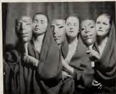
A chorus rehearsal of Orfeo , showing Greek masks used in a performance at Eaton Auditorium