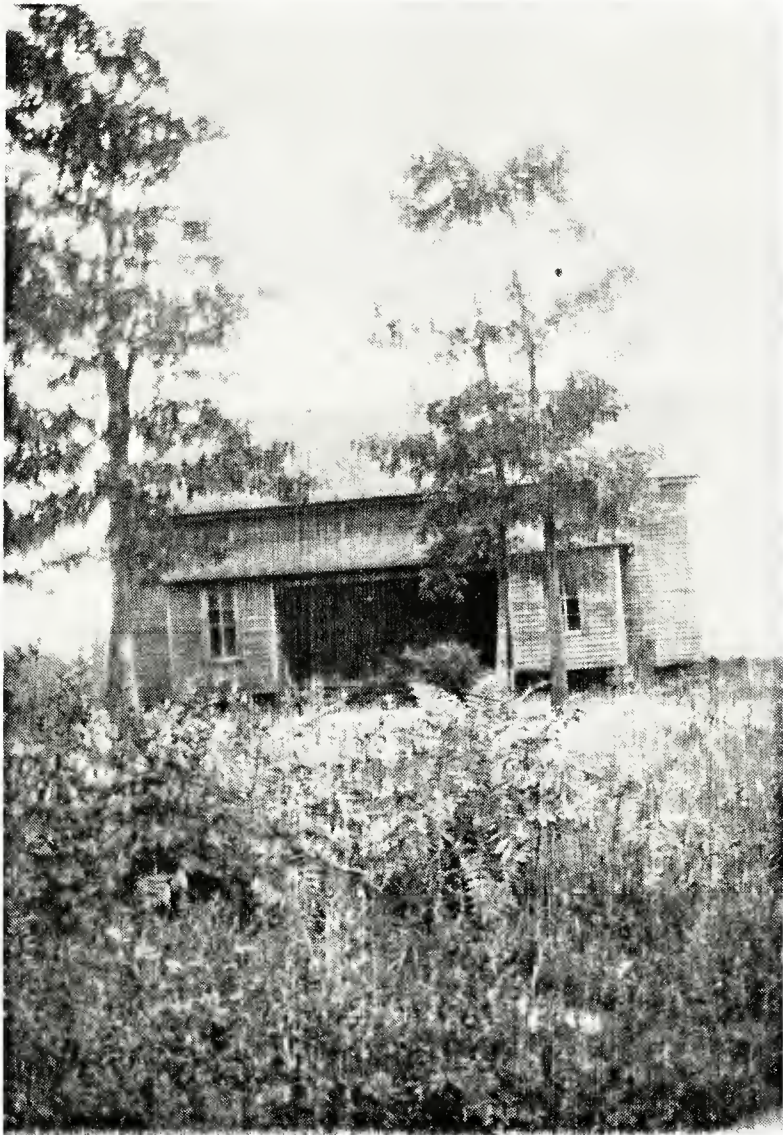
Union Grove Schoolhouse