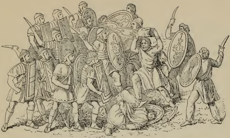
ROMANS AND BARBARIANS (FROM COLUMN OF TRAJAN)