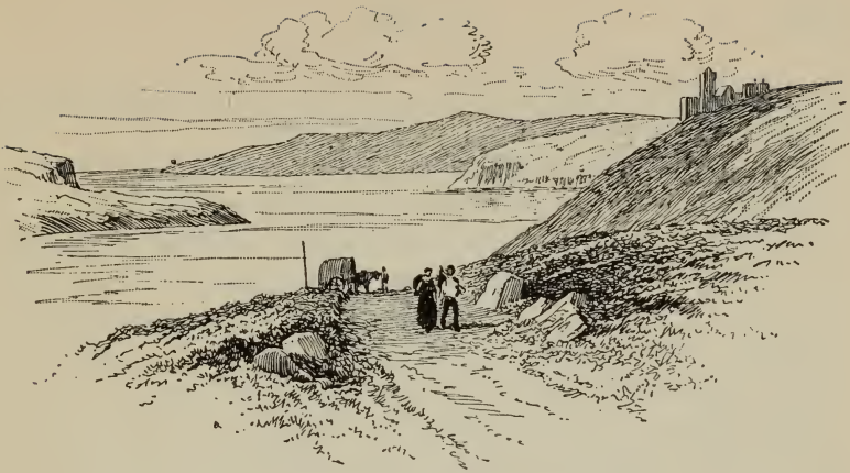
VIEW NEAR MILFORD