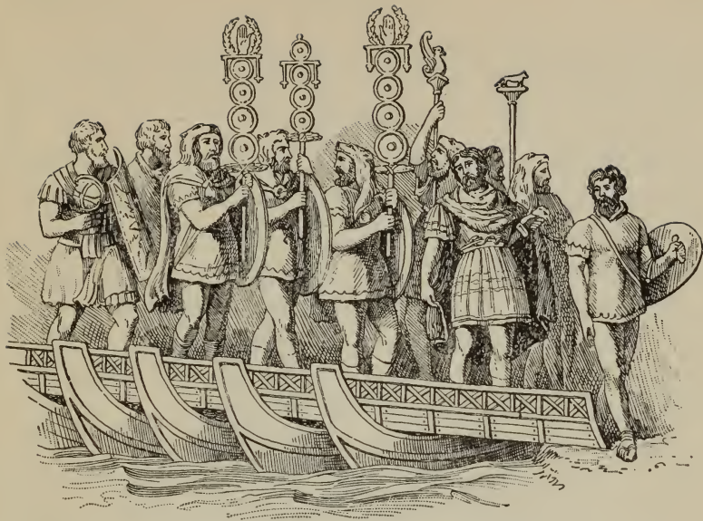
ROMAN GENERAL AND SOLDIERS