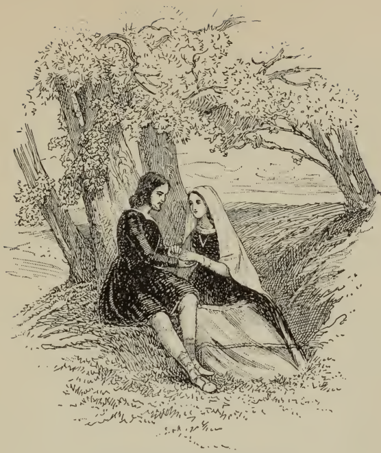
LEONATUS AND IMOGEN