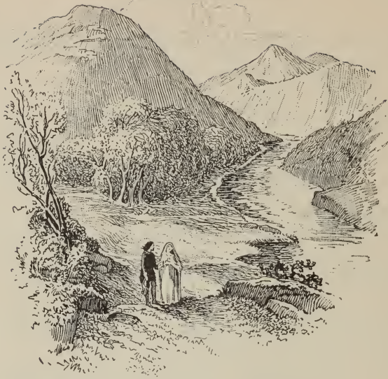
PISANIO AND IMOGEN (SCENE 4)